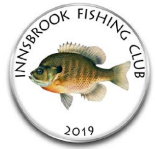
Membership Pin 2019

The Fishing Club depends on everyone's support to provide activities, resources, and fun events. The last several years we have had several key people donate to support the Club. We would like to encourage your personal support for the Club. Dues help pay for our events, activities, tournaments, attendance prizes, habitat restoration projects, fish stocking, newsletters and website hosting. Thank you to the members who have renewed their membership for 2019. If you have not, please consider joining.