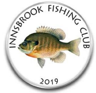
Membership Pin 2019

Thank you to the members who have renewed their membership for 2019. If you have not, please consider joining.