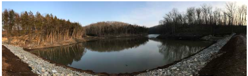
Frieden Lake Nearing Full Pool

We have created a unique partnership with Optimal Fish Food and South Dakota State University (SDSU) to help stock several lakes this spring. In our previous newsletter, it was reported Frieden Lake would be stocked for a traditional largemouth bass population. Due to our partnership with Optimal and SDSU, we will be introducing SMALLMOUTH BASS to Innsbrook. This is a special opportunity for us and our partners. Frieden will be stocked with a forage base of Redear Sunfish and Smallmouth bass this spring. Two fish feeders will be installed to provide additional nutrition. Fish growth rates, sizes and weights will be monitored the next few years by a SDSU graduate student. You are welcome to fish Frieden. PLEASE RETURN ALL FISH. Take a picture, record the length and share with the club.