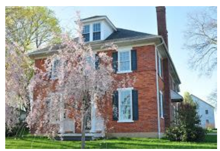
Lancaster County, PA