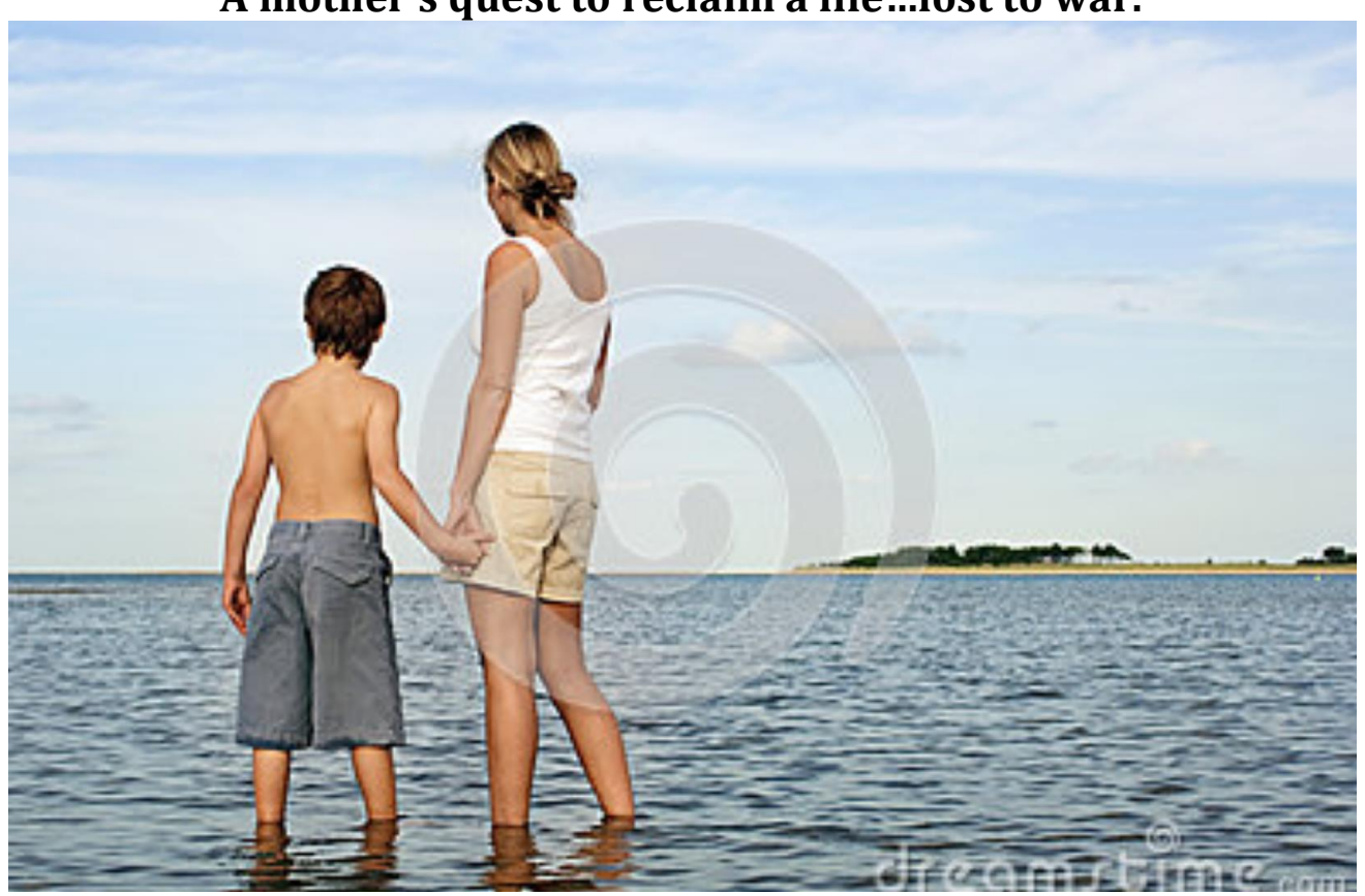
A love story, a spy story...based on true stories.

A mother's quest to reclaim a life...lost to war.