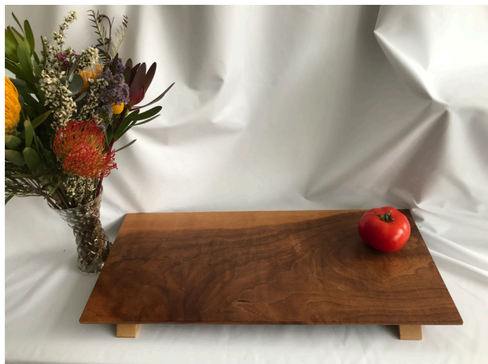
Walnut AUD 150