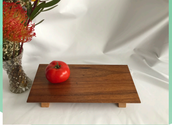
Blackwood, AUD 65

Presenting our elegant raised Charcuterie Board range in American Walnut and Tasmanian Blackwood. These boards, with their rich, dark hues and fine-grained texture are finished with an eco-friendly, food-safe hard wax oil, enhancing the innate beauty of the timber while ensuring their enduring longevity. The Charcuterie Boards may serve as a decorative and functional platform for culinary delights or as a work of art in their own right.