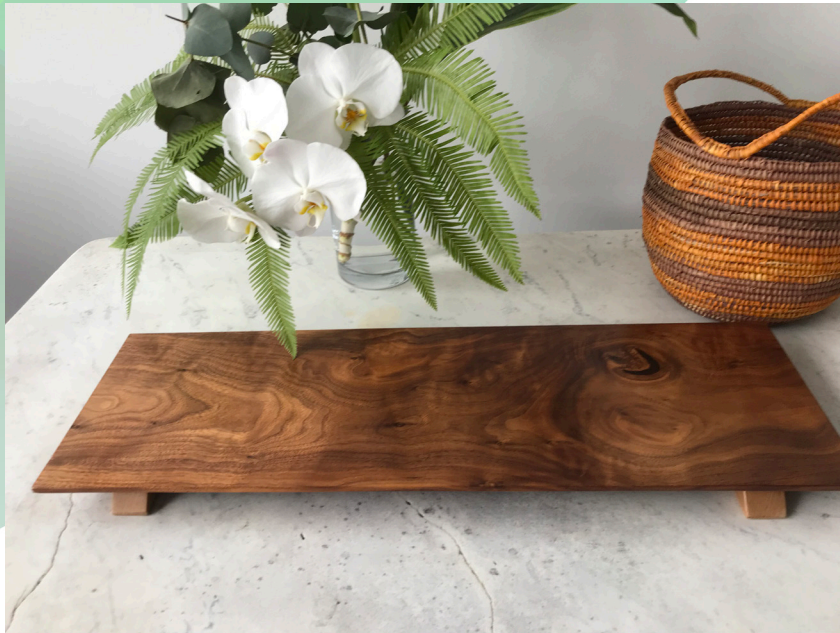
Walnut AUD 150