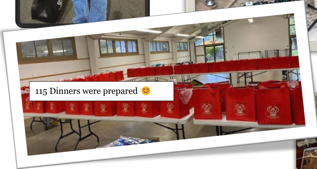
115 Dinners were prepared 😊