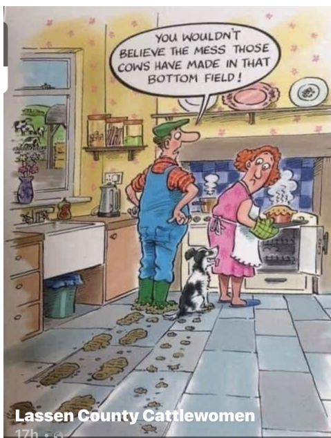
Lassen County Cattlewomen

March 21-24, 2024: National FFA Convention in Sacramento