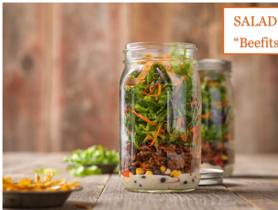
SALAD SHAKERS... "Beefitswhatsfordinner"

Santa Barbara County CattleWomen "Ask the Cow Gal"