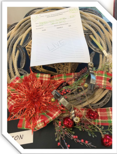
Horseshoe rope wreath by Denise Ding ...awesome!