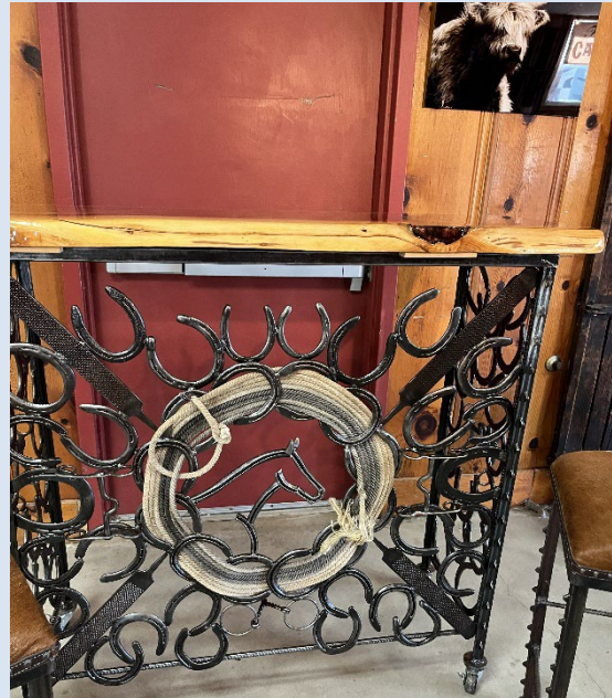
DENISE DING: 1 ST Place in Furniture @ Red Bluff Art Show