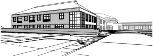
PERSPECTIVE VIEW - FROM FACULTY PARKING / BUCKEYE CRESCENT EXIT DRIVE