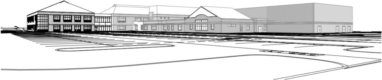
PERSPECTIVE VIEW - FROM GREENBRIAR ENTRY DRIVE