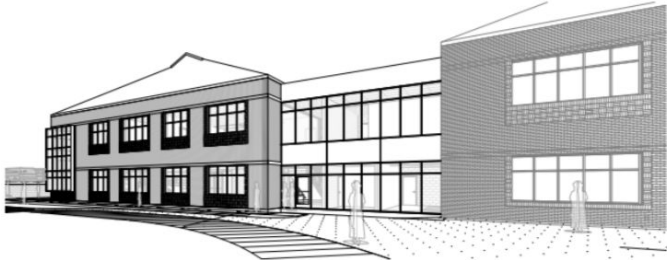
PERSPECTIVE VIEW - FROM BUS DROPOFF / MAIN ENTRY