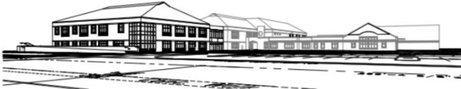
PERSPECTIVE VIEW - FROM THOMAS / FRONT LAWN