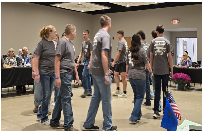
YOUTH DOING THE DRILL MARCH FOR THE 5TH DEGREE