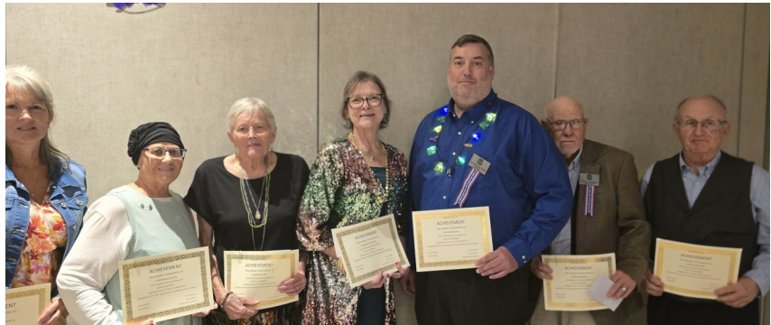
SUBORDINATE GRANGES WITH INCREASES IN MEMBERSHIP WERE AWARDED CERTIFICATES