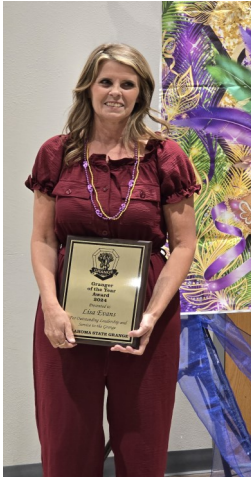
GRANGER OF THE YEAR