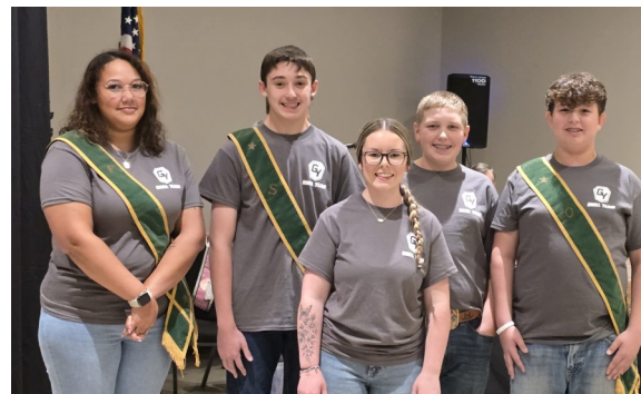
CANDIDATES WHO RECEIVED THE 5TH AND 6TH DEGREES