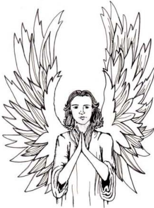
Lucifer - A Metaphorical reference to the King of Babylon

These scriptures clearly describe the peoples awe at Nebuchadnezzar's fall