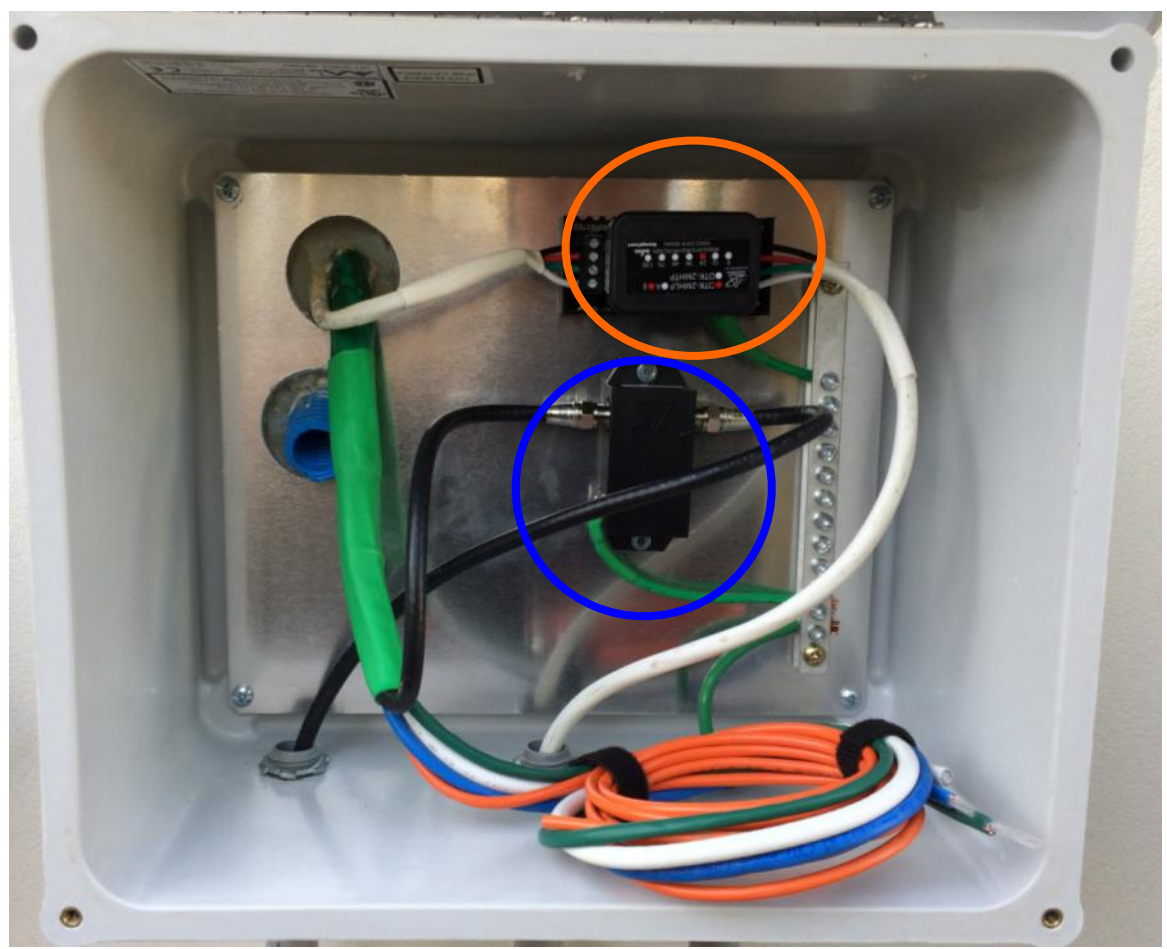
IF No Cablevision or internet, bypass coax with barrel connector