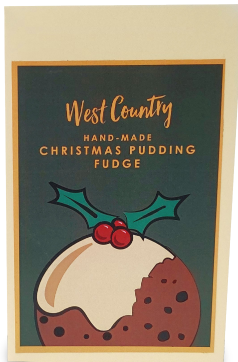
CHRISTMAS PUDDING FLAVOUR FUDGE 150G CP2