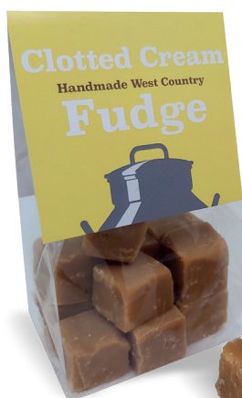
HM1 CLOTTED CREAM FUDGE 150G