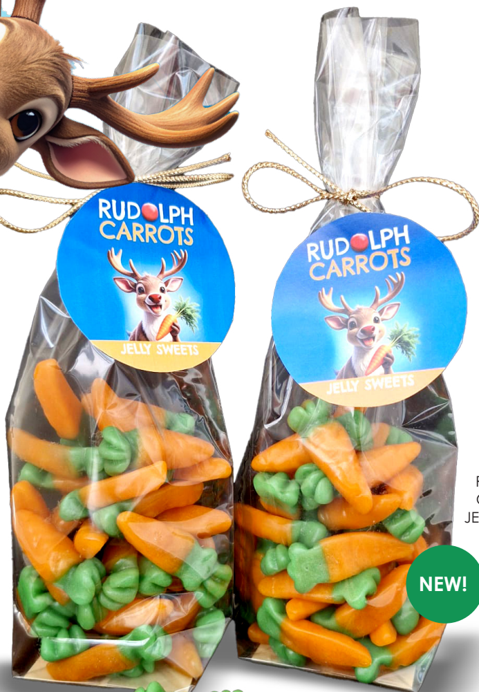
RUDOLPH CARROTS JELLY SWEETS 150G RJC1