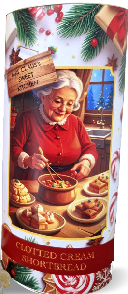
MRS CLAUS CLOTTED CREAM SHORTBREAD 200G MRS2