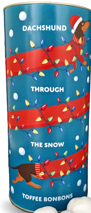
DACHSHUND BON BONS 150G DAS1