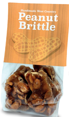
HM9 PEANUT BRITTLE 150G