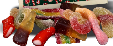
'ELFy BREAKFAST' JELLY SWEET MIX 150G ELF1