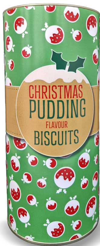
CHRISTMAS PUDDING FLAVOUR BISCUITS 200G CP1