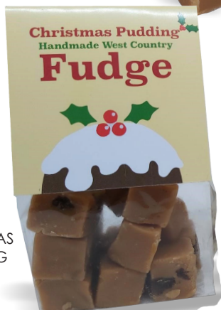
CP3 CHRISTMAS PUDDING FUDGE 150G