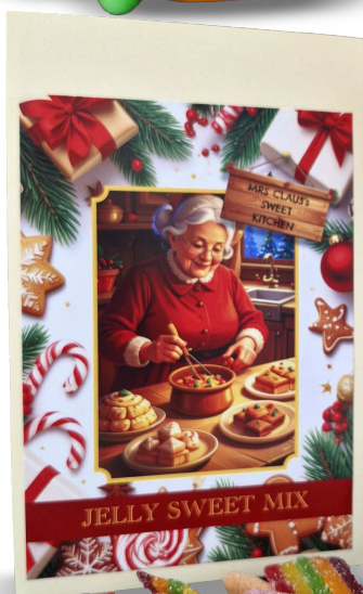
MRS CLAUS SWEET KITCHEN JELLY SWEET MIX 150G MRS1