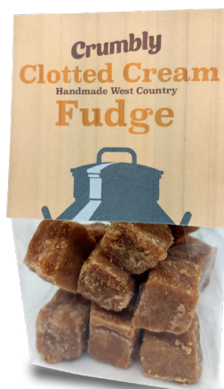
HM10 CRUMBLY CLOTTED CREAM FUDGE 150G