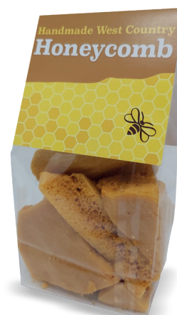
HM8 HONEYCOMB 125G