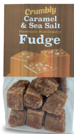
HM11 CRUMBLY CARAMEL & SEA SALT FUDGE 150G