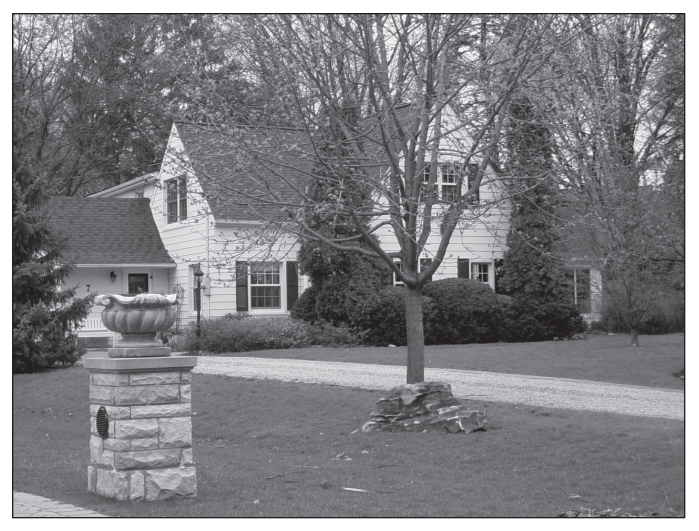
Figure 2: A typical Thorncrest Village home

offered numerous efficiencies, including greater standardization, increased buying power for a developer who built many homes at once, and the possibility for communal buying of fuel, food, and shared services like security and snow plowing. All of this led to greater profitability for the developer and secure home values for residents.