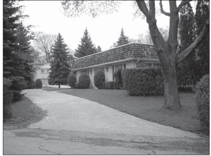
Figure 3: A second typical Village home