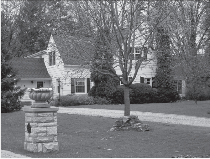
Figure 2: A typical Thorncrest Village home

offered numerous efficiencies, including greater standardization, increased buying power for a developer who built many homes at once, and the possibility for communal buying of fuel, food, and shared services like security and snow plowing. All of this led to greater profitability for the developer and secure home values for residents.