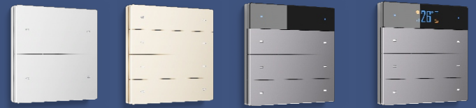
4 Button 8 Button 6 Button with Gesture Thermostat