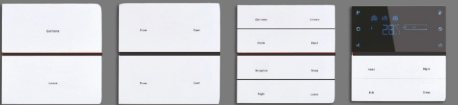
2 Button 4 Button 8 Button 3in1 Thermostat