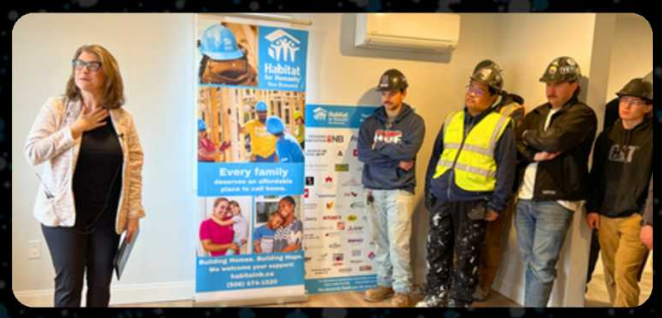
This occasion marks the first home dedication of 2026, and the fourth family to move into homes on DeMerchant Drive, an innovative affordable-by-design community.

We are accepting applications for 10 homes across New Brunswick For more info and to apply - see the section above