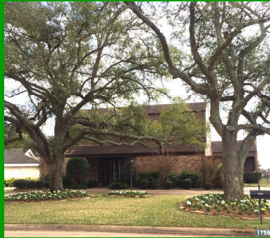
1758 Country Club