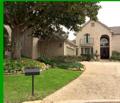
226 South Keswick