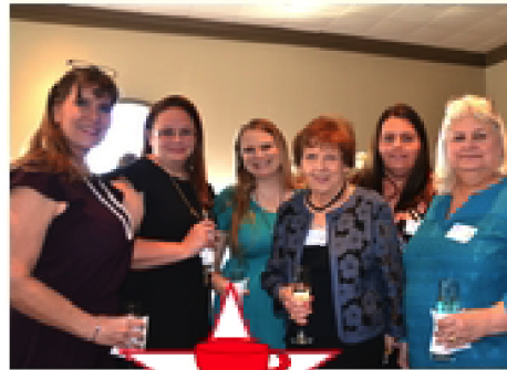
Friendship Day February 8, 2020