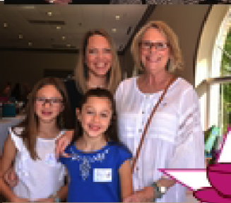
"A Special Blend Of You And Me"