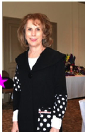
"Friendship is Like a Cup of Tea. . ."