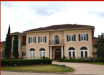
Al & Inge Duran 1247 Creekford Circle