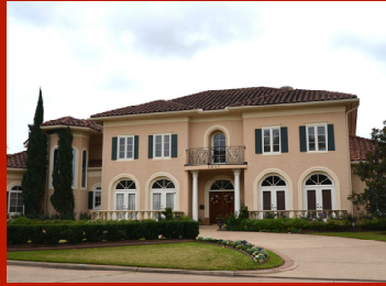
Al & Inge Duran 1247 Creekford Circle