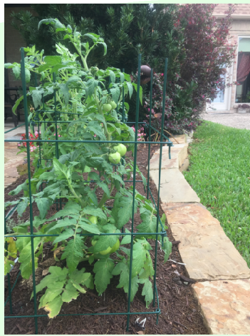
Miriam Watson shows that it is possible to grow both flowers and food, even without a lot of garden space