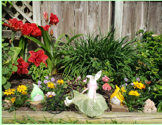
Gnomes in Jenny Schultz's garden celebrating Easter