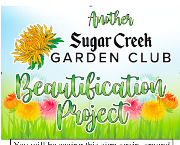
You will be seeing this sign again, around the neighborhood, as we work on more beautification projects