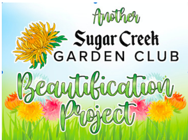
You will be seeing this sign again, around the neighborhood, as we work on more beautification projects