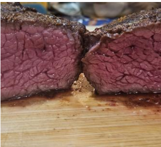
LOCALLY FARMED BEEF

From steaks, hamburgers, to chuck roast and brisket, I support a local farmer by buying beef up the road. You will taste the difference!