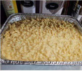
SMOKED MAC & CHEESE

Homemade mac and cheese made with 5 different types of cheeses and then smoked for flavor