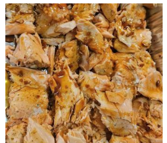
SOY BROWN SUGAR SALMON

Layers of memories are put into this awesome favorite. I offer traditional red sauce and Chicken Alfredo version.