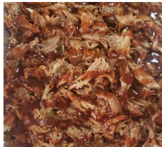
SMOKED PULLED PORK

From steaks, hamburgers, to chuck roast and brisket, I support a local farmer by buying beef up the road. You will taste the difference!