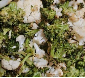
BROCCOLI AND CAULIFLOWER