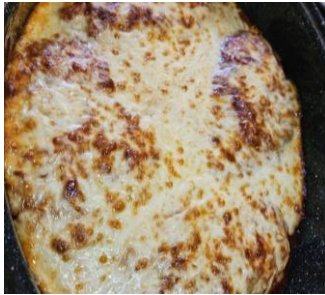
CHICKEN PARMESAN $40

Cabbage boiled, then center stem shaved off for tenderness. Stuffed with locally farmed meat and rice. 8 rolls for $20.00