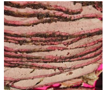
BRISKET $65 FLAT $120 WHOLE

Beautiful smokey flavor, sliced thin and dressed in my homemade honey glaze. $55.00