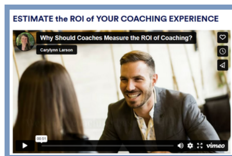
Why Measure ROI? (<2 min video)