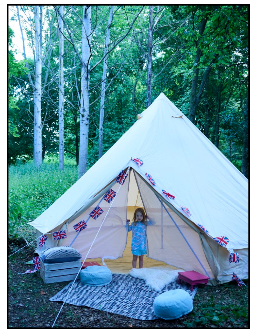
Woodland Glamping available for wedding night, starting at £150 per tent