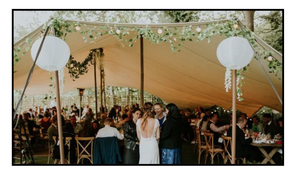
Stretch Tents are our most cost effective choice & we can create a bespoke budget accordingly

2 pole Tipi up to 90 guests seated (plus extra space for 30 evening guests) *£7,250