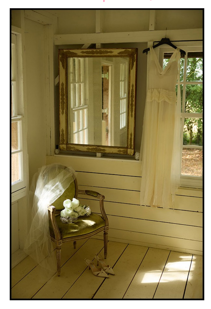
Our wedding couple is invited to stay in the Cabin accommodation