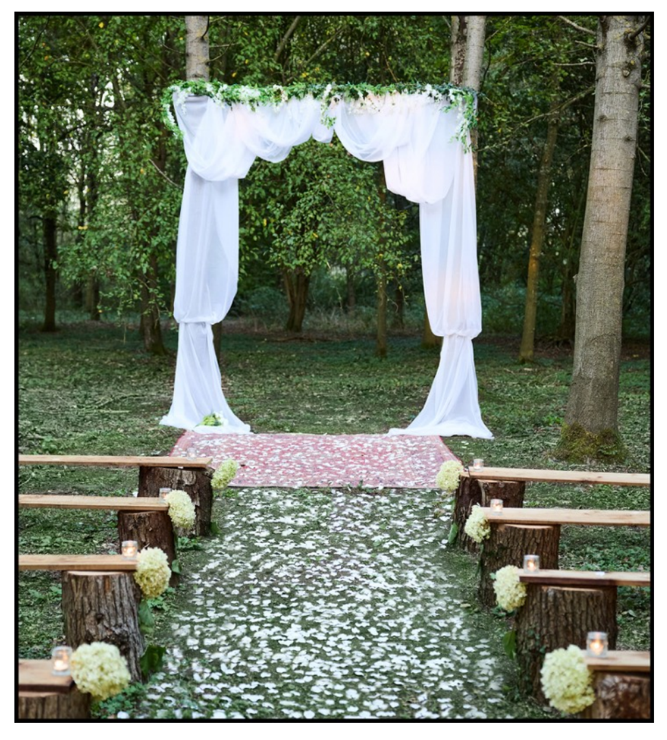
Our romantic woodland ceremony's setting. Weather permitting