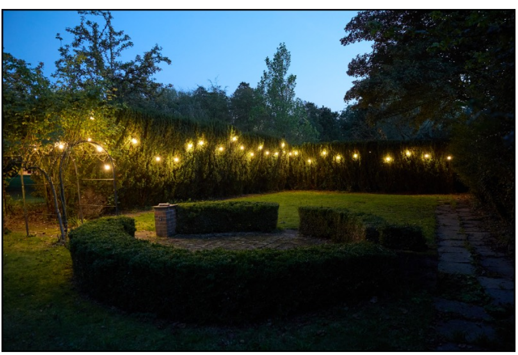
Chill out in the hidden garden