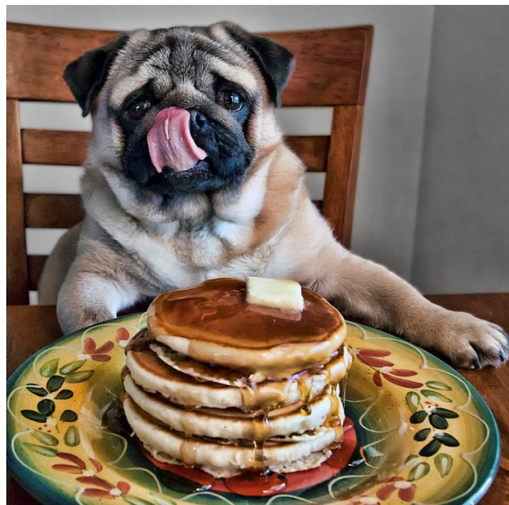
Faith, food, & fellowship Every Monday morning in the Wolf Center, 6:30am