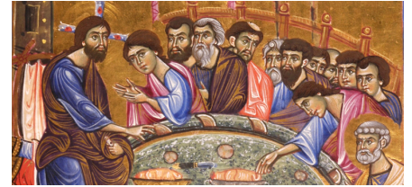
Medieval painting of the Lord's Supper

A huge portion of Jesus' ministry took place at meals, and around mealtimes. At mealtimes is where Jesus showed God's love in abundance, like when he changed water into wine at Cana, and when he multiplied the loaves and the fish to feed thousands. It is where he welcomed the unloved and the sinners, and challenged the powerful. It is where he showed his disciples how the greatest among them must be the greatest servant, when he washed their feet. It is where he saved Peter's life by forgiving his betrayal, over a breakfast of fish on the beach. It is where he was made known to them in the breaking of the bread, when he appeared to many and said the prayer of thanks over the meal at Emmaus. And so, mealtimes have been a sacred thing since the earliest days of the church.