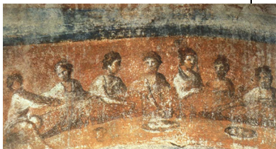
Newly discovered fresco showing people sharing Holy Communion, 2 nd century. Possibly showing a woman officiating.

When you worship this week, you can make mealtime a sacred thing.