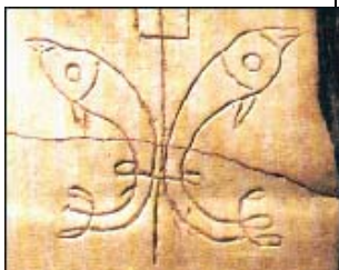
Ancient Christian fish symbol, found in Roman catacombs