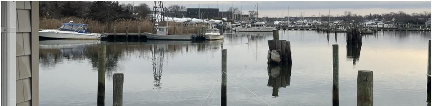
Panoramic look at the view from the Club on a quiet winter morning