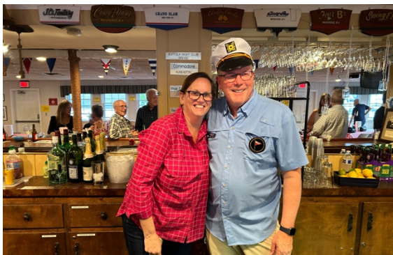
A couple of snapshots from our June meeting.