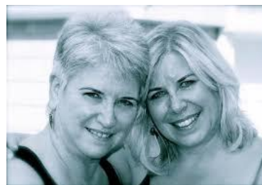
The Psychic Sisters coming to SBC in January.