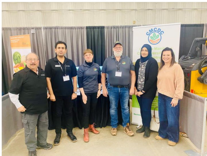
Manitoba Potato Production Days 2024

For project findings and recommendations, please visit the following websites for our Annual Reports or scan the QR code