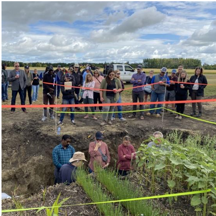
August 2023 Field Day