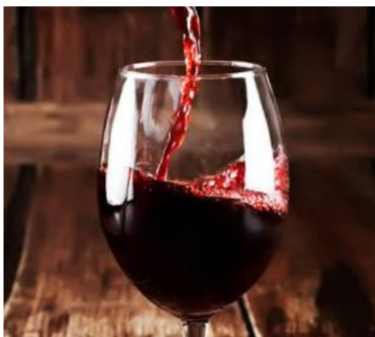
Bar with Weekly Happy Hour