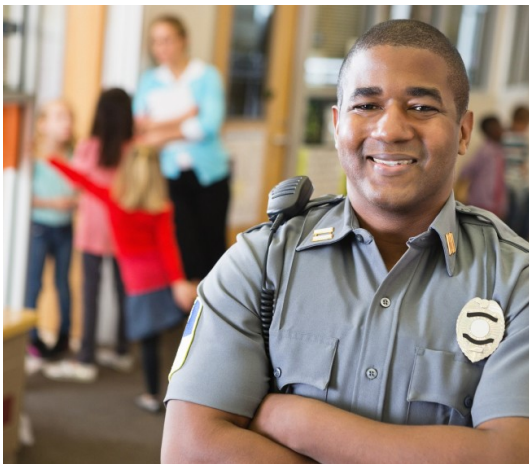
Manned Nightly Security