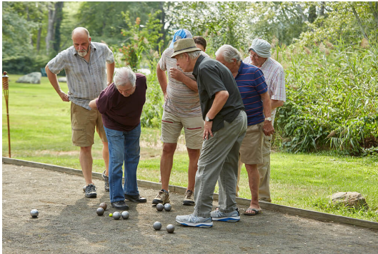
Petanque Court (Bocce Ball or Boules)