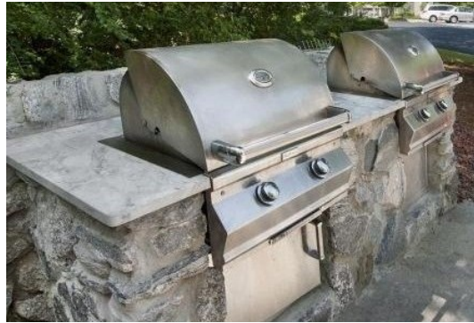
Outdoor Bar BQ Grills