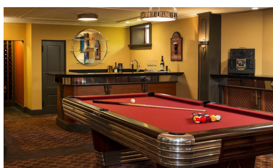
Game room with pool table, golf simulator, foosball, ping pong