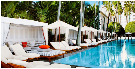
Swimming Pool & Cabanas