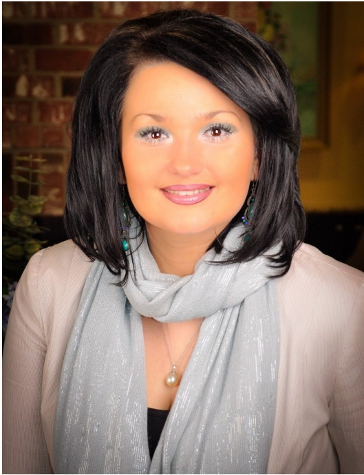
Onsite Management and Maintenance