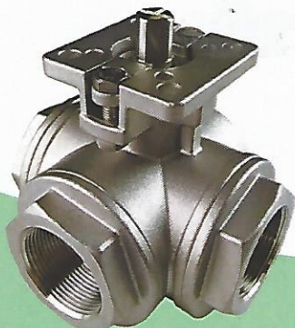
DMMPT200 3-Way 1/2"-3"

Stem Leak Detection Window Prevents Actuator Damage in the Event of Valve Stem Leakage.