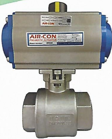
DM2000 API-607-7 Fire Safe 1/2"-4"