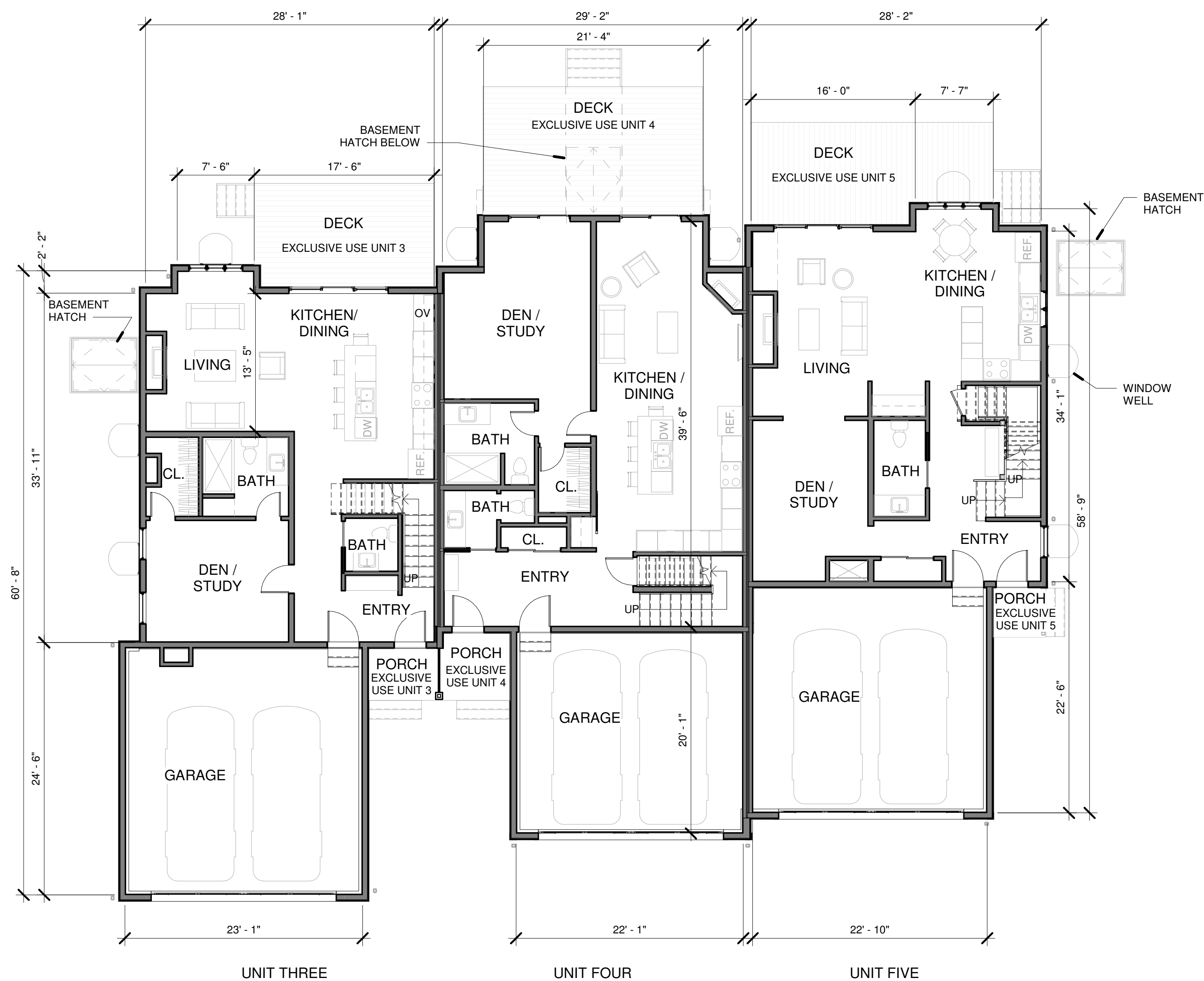
2 FIRST FLOOR 1/8" = 1'-0"