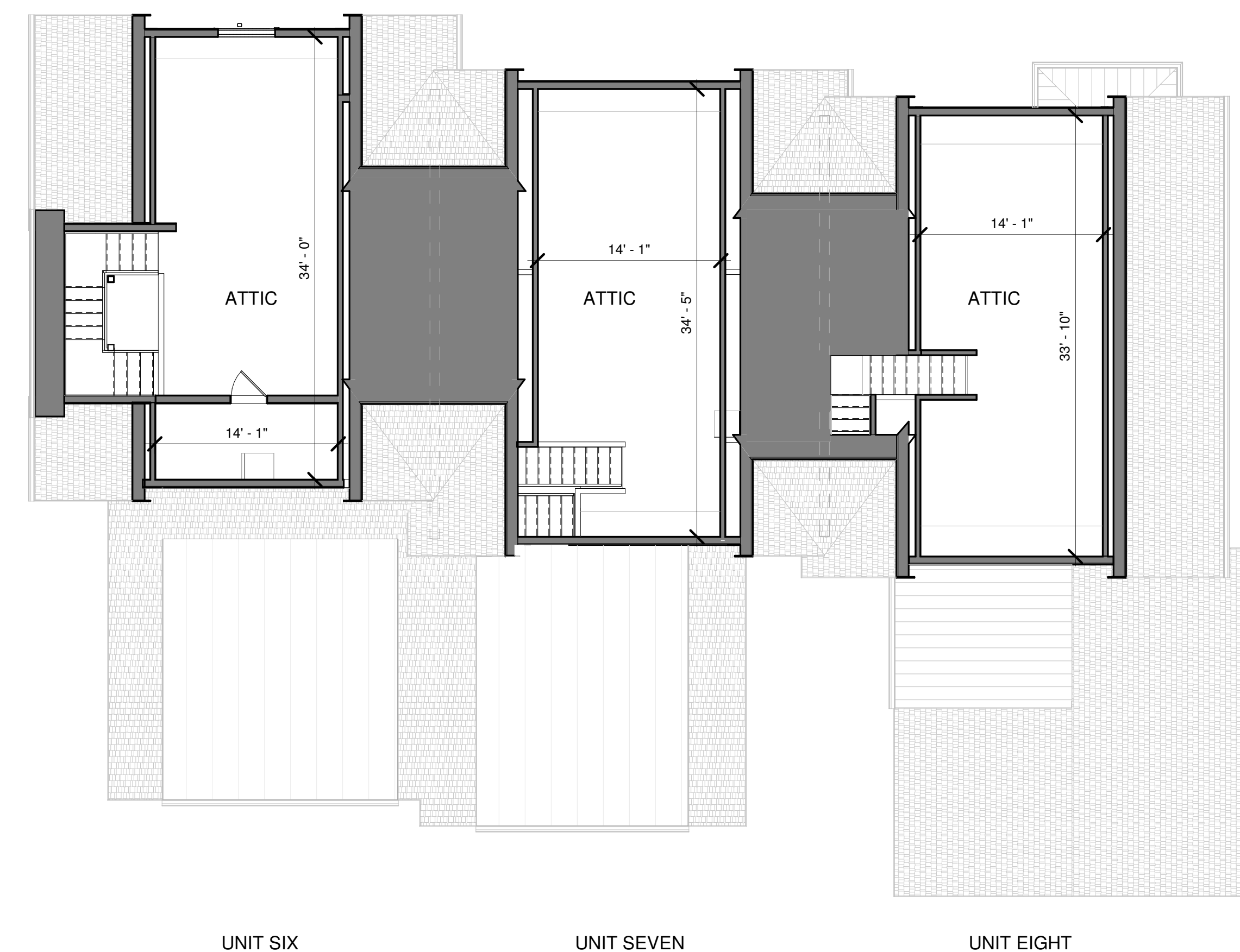
UNIT SIX UNIT SEVEN UNIT EIGHT