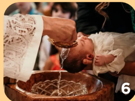
6 SACRAMENT OF BAPTISM PREP CLASS 9 AM TO 12 PM OLPH