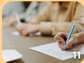
11 OCIA FIRST INFORMATIONAL MEETING @ 6 PM SJA HALL