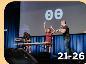
21-26 LIFE TEEN LEADERSHIP CONFERENCE (NO DAILY MASS)