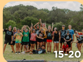
15-20 COVECREST & HIDDEN LAKE (NO DAILY MASS)