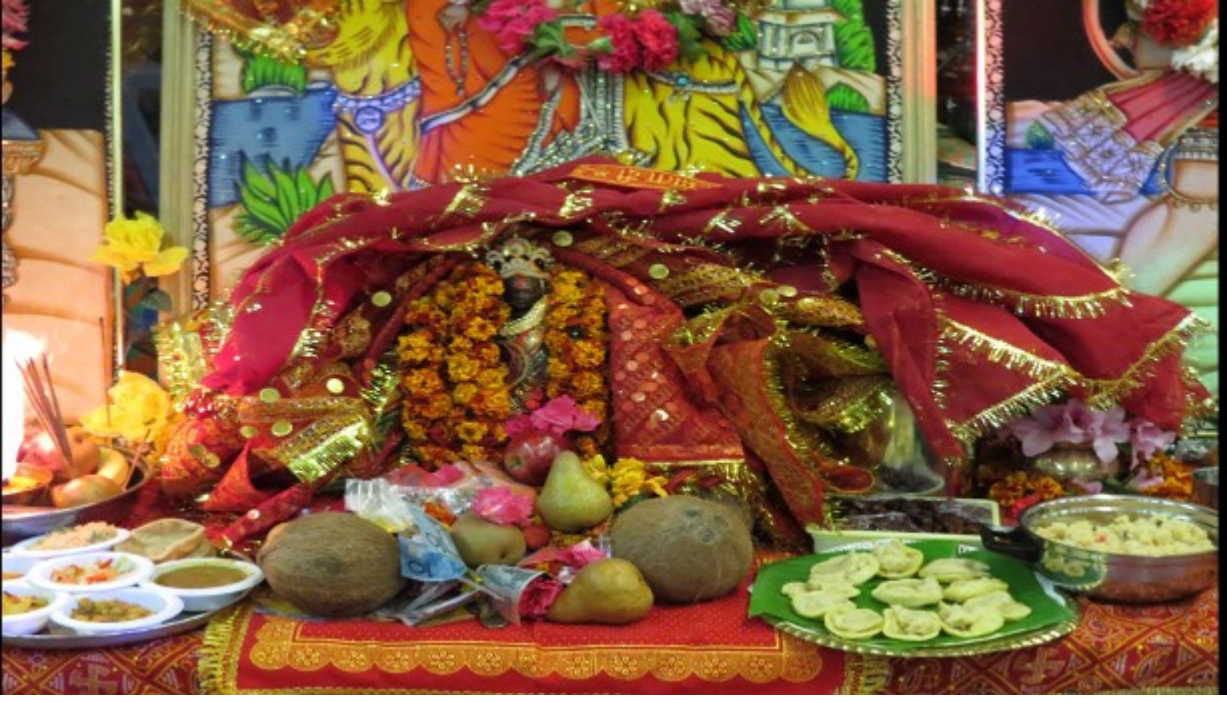
Durga Maa with offerings of Red Chunrari from her Devotees