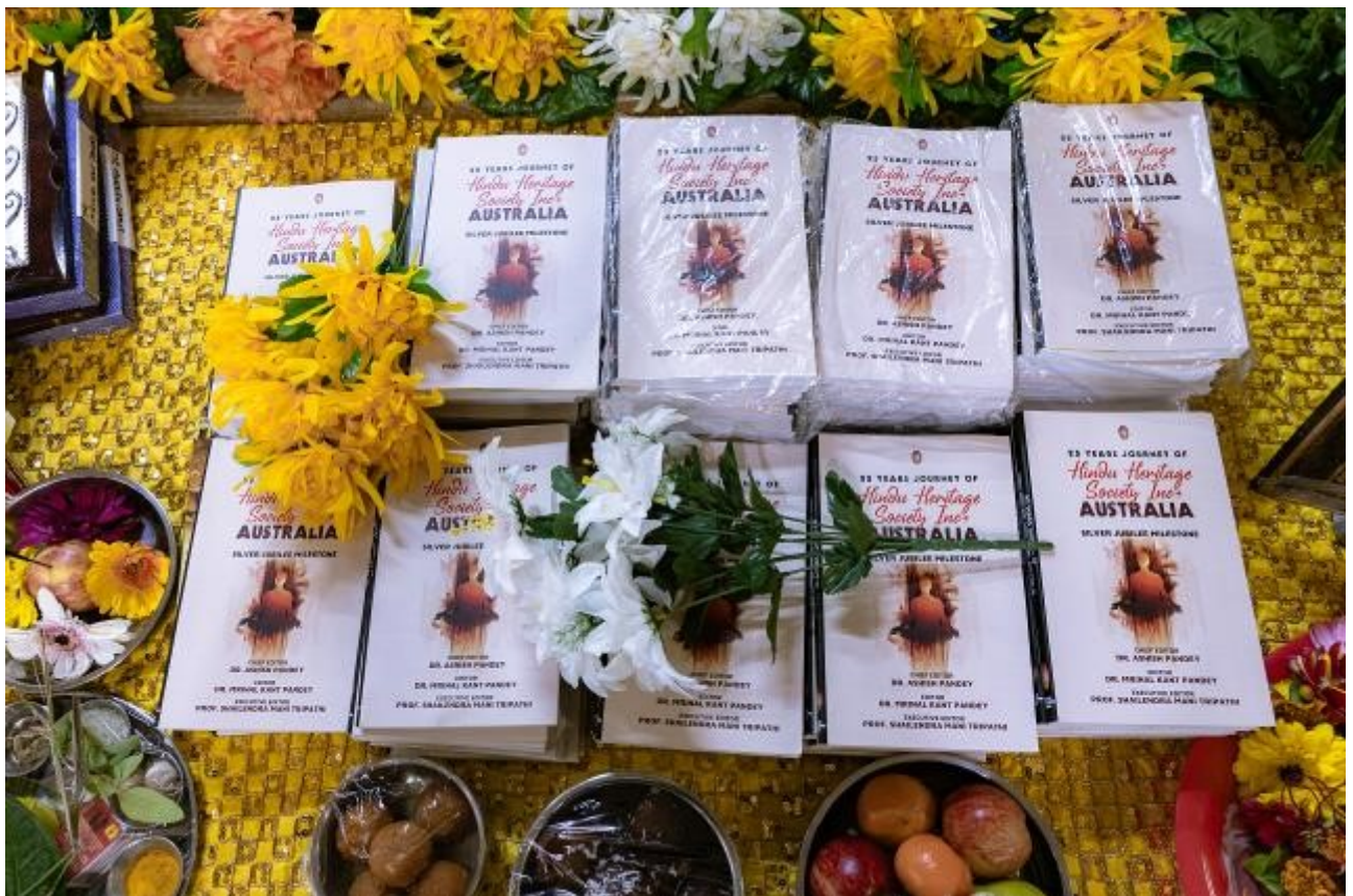
Book published on occasion of silver jubilee celebration of HHS