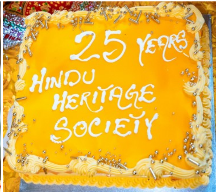
HHS Committee members are cutting the cake