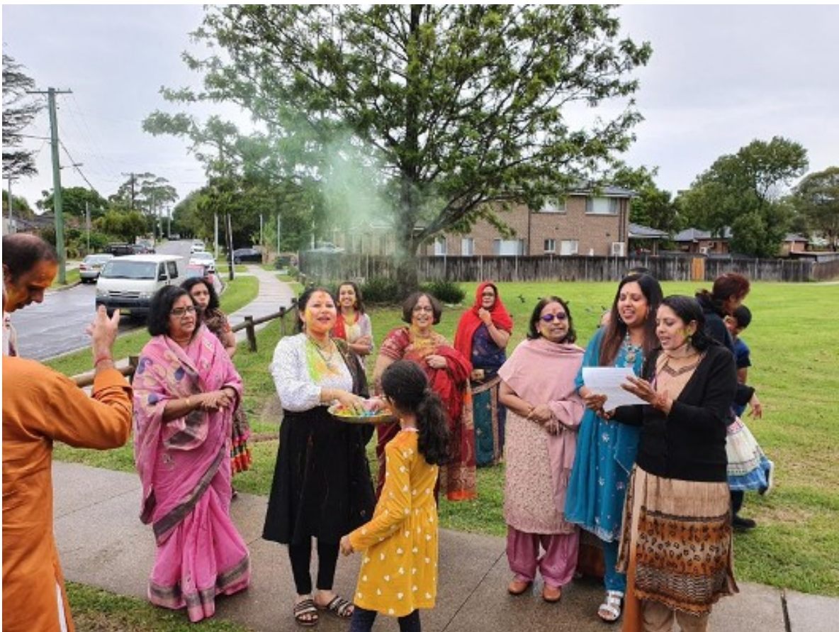
Holi Khele Raghubeera - Sydney Australia mein Holi Khele Raghubeera