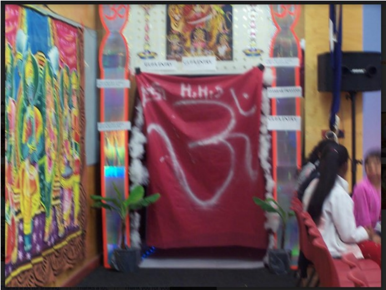
Real life Durga Ma Guffa (Cave)

diorama built for participants to experience divine energy of Mata