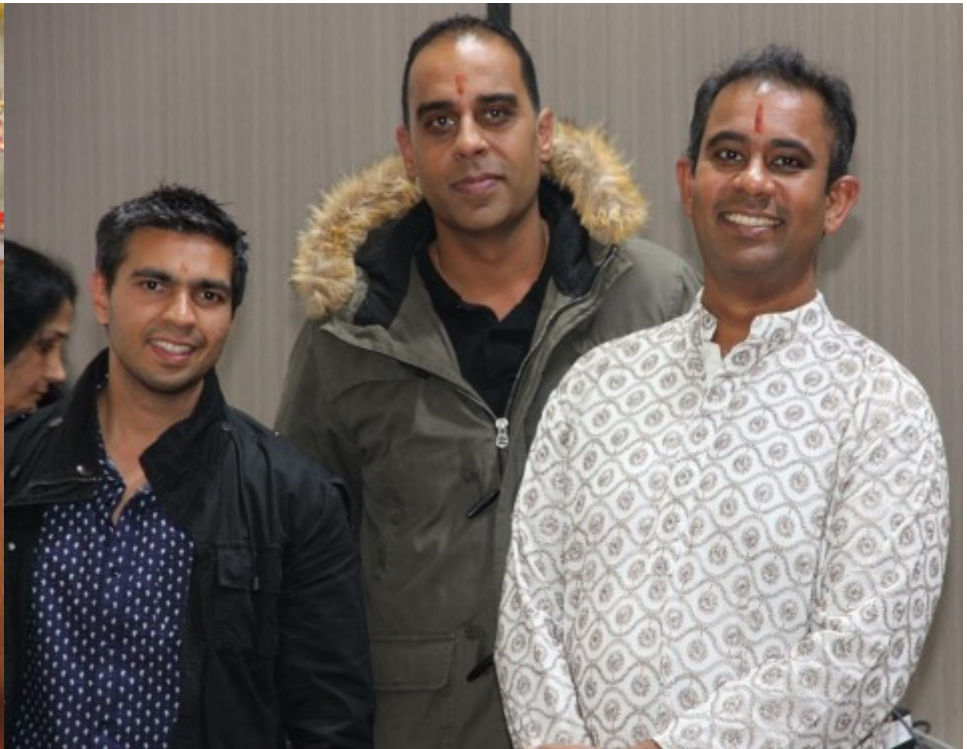
Memories Past Events celebrated by HHS