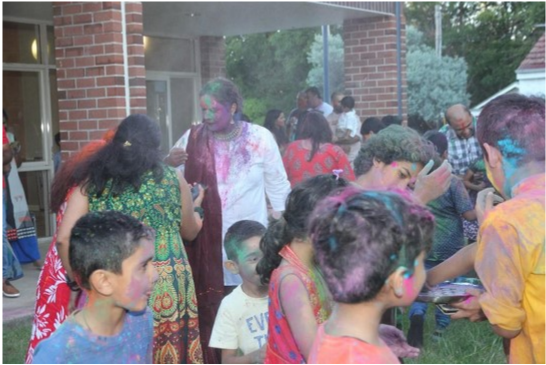
Children enjoying Holi