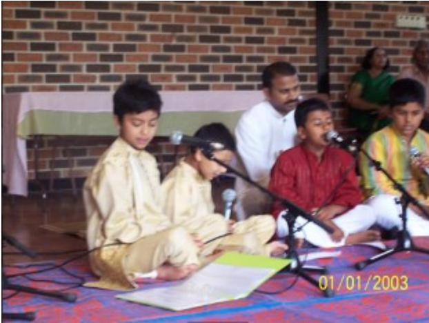
Children participating in Vedic Mantra recitals