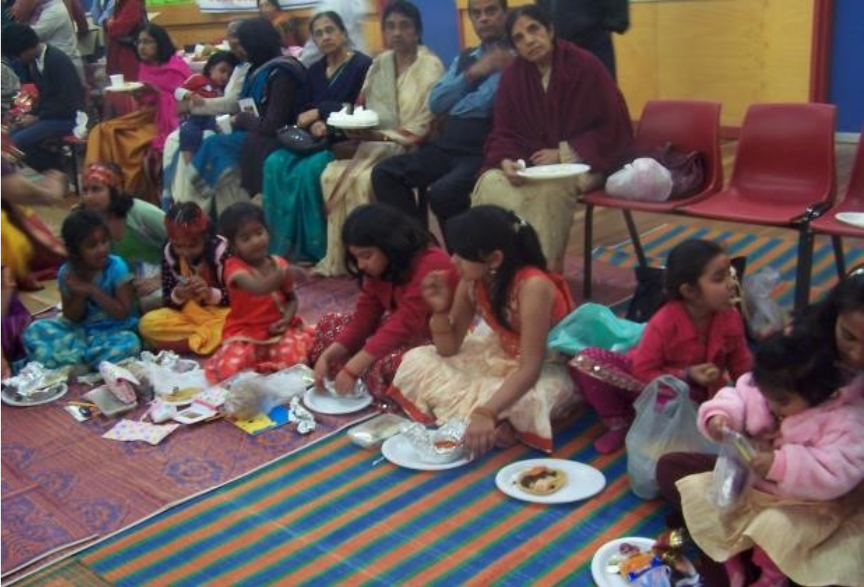
Kanya pooja during Durga pooja.

प्रथमं शैलपुत्री च, द्वितीयं ब्रह्मचारिणी । तृतीयं चन्द्रघण्टेति, कूष्माण्डेति चतुर्थकम् ॥ पंचमं स्कन्दमातेति, षष्ठं कात्यायनीति च । सप्तमं कालरात्रीति, महागौरीति चाष्टमम् ॥ नवमं सिद्धिदात्री, च नवदुर्गाः प्रकीर्तिताः। उक्तान्येतानि नामानि, ब्रह्मणैव महात्मना ॥