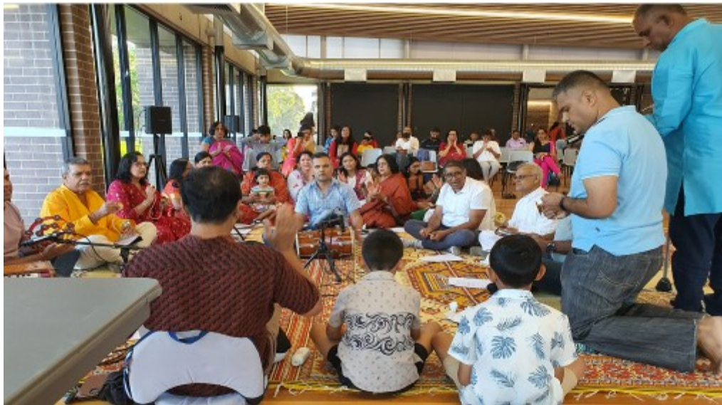
Traditional Chautala (folk song) singing in session with live instruments

Holi is celebrated by the Hindu Heritage Society, in Sydney annually, although Holi Festival is primarily celebrated by Hindus, the Holi Festival is very inclusive.