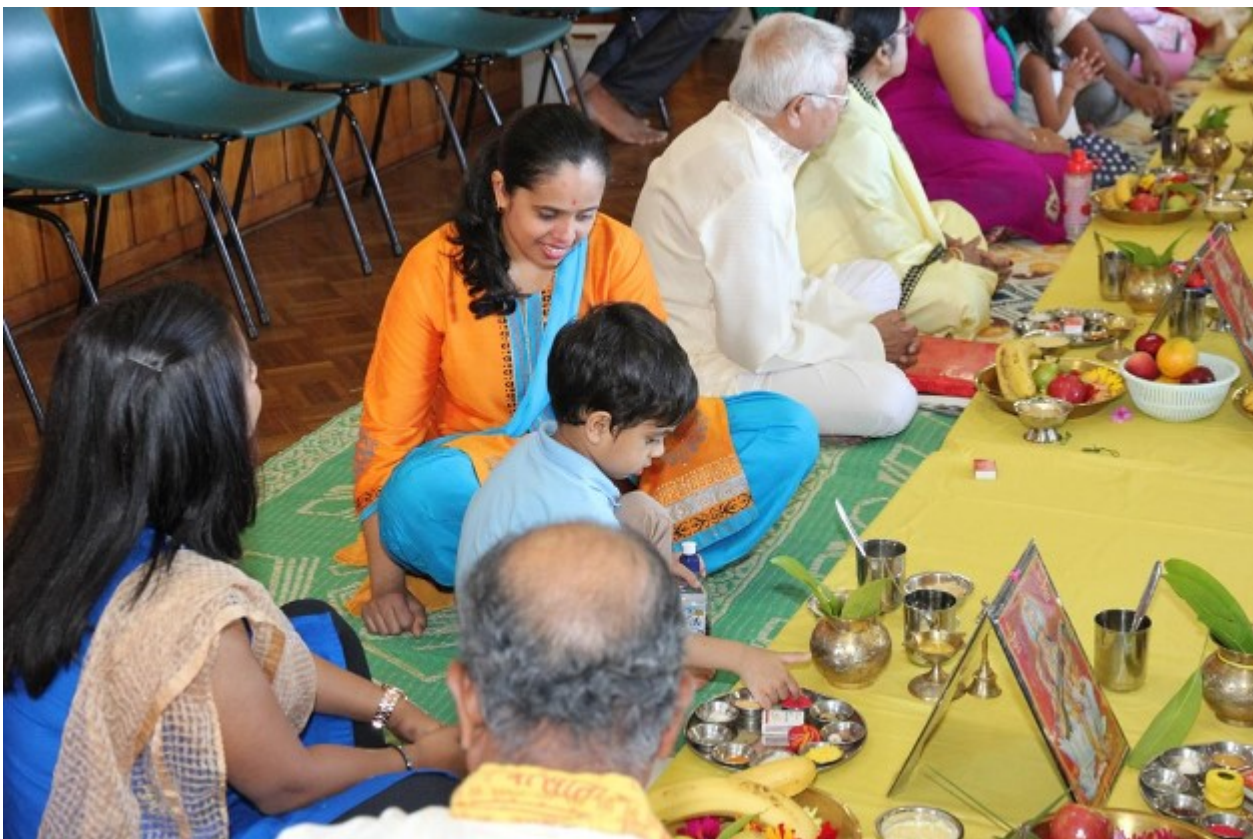
Young and Old alike