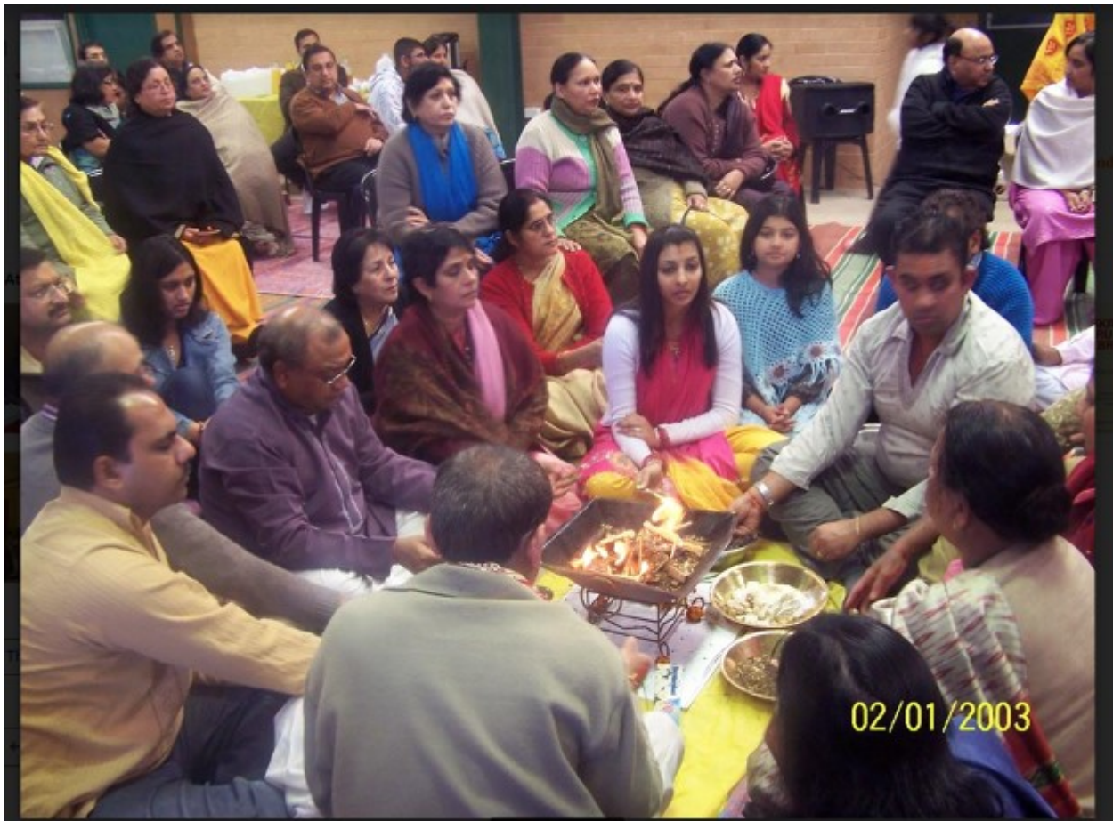
Havan Yagna at Hindu Heritage Society Puja Function