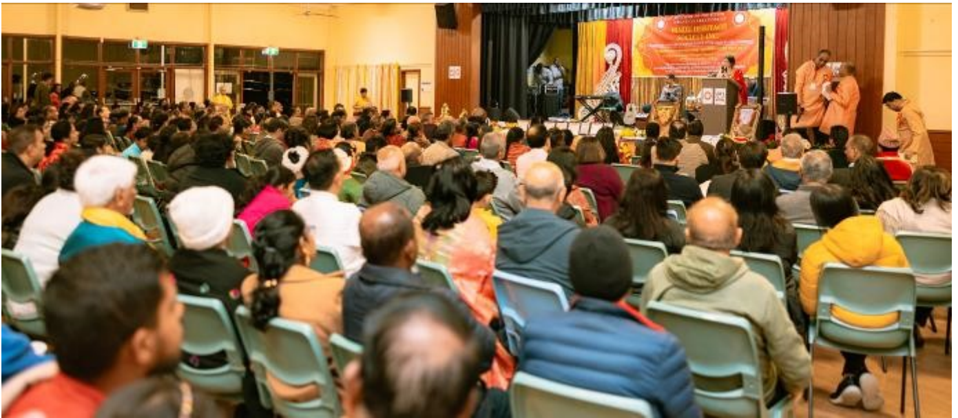
HHS 25th annual celebration was well received by devotees.