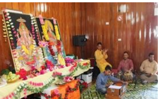
Musicians at Saraswati Puja