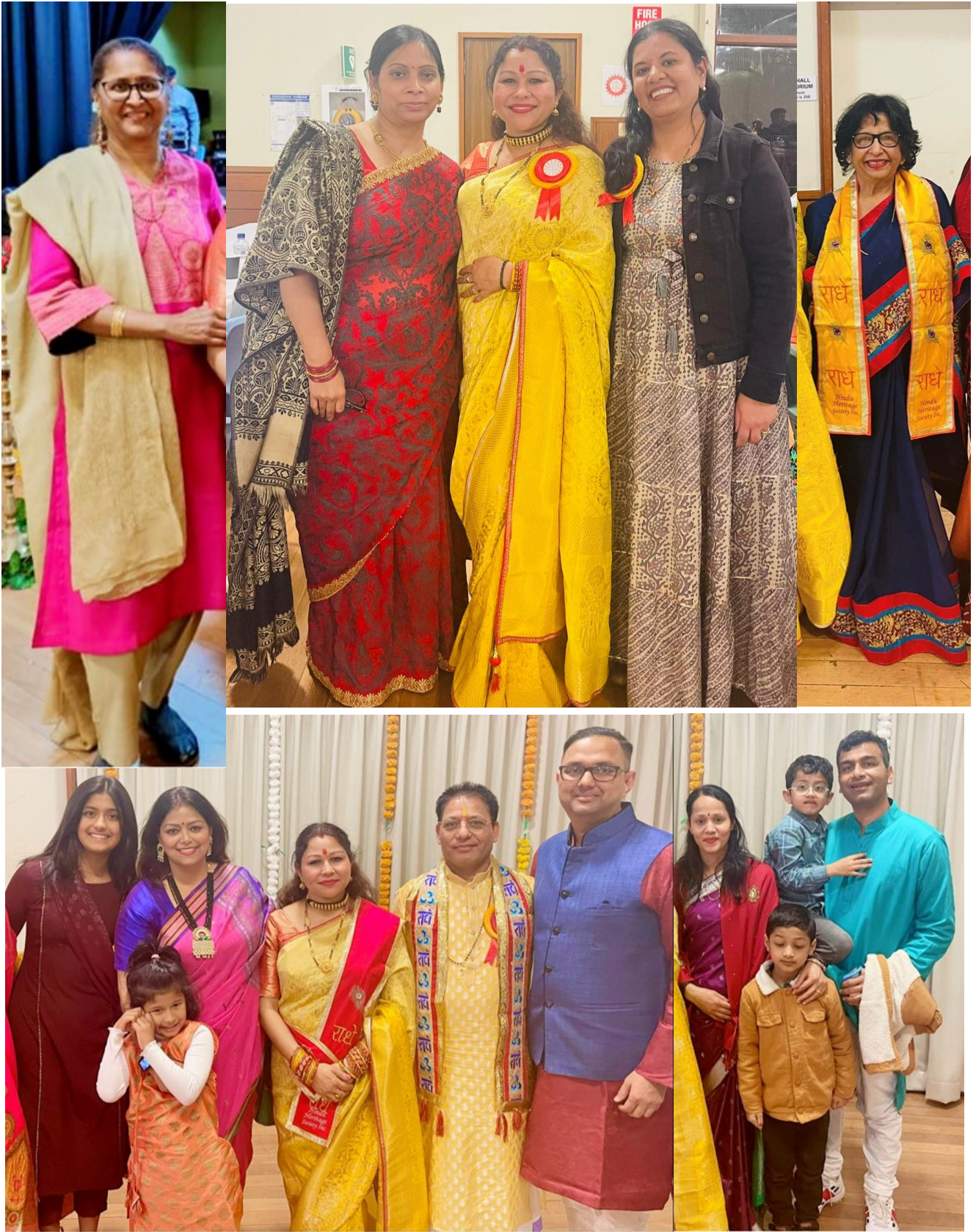
Guru Purnima celebration was well attended and enjoyed by many devotees.