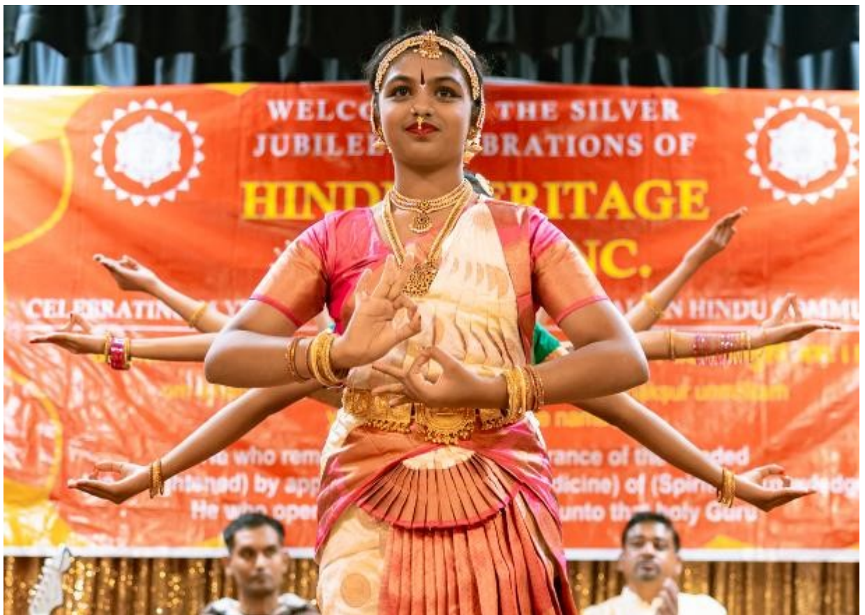
Natyavedan student performing the divine Natyam (Dance)