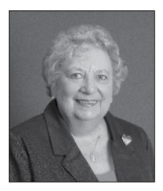
National Chief of Staff 11510 State Route M Ste. Genevieve, MO 63670 vfwaextension24-25@outlook.