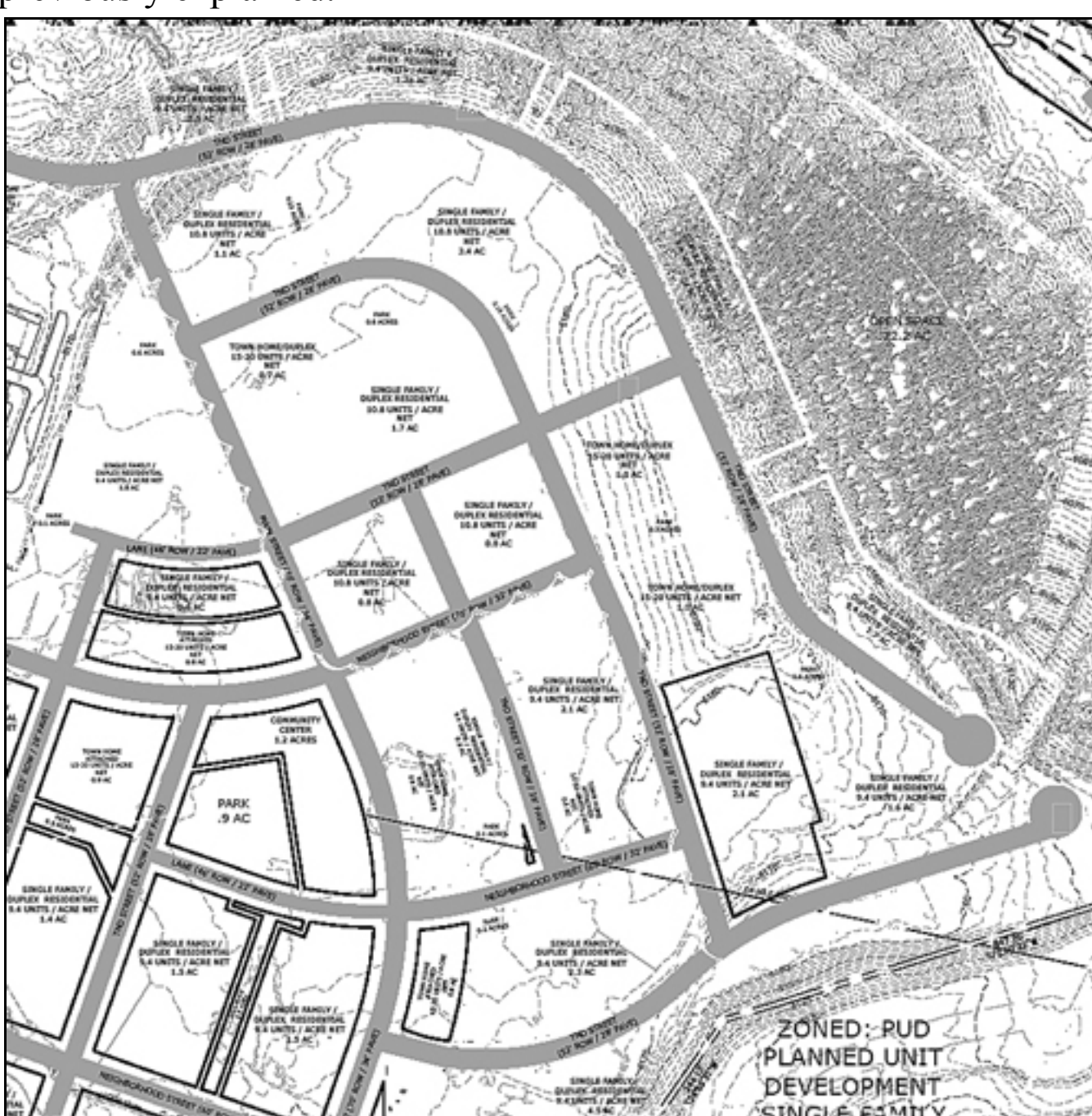
A graphic displays a close-up of the current Gold Hill Mesa concept plan - limited to the areas planned for development on top of the tailings dam (including Filings 9 and 10) and the dam face which is now designated as "open space." The face was planned for housing in the '04 concept plan (see graphic higher up on page). Courtesy of Colorado Springs Planning and Gold Hill Mesa

For the Gold Hill Mesa project, the homes are built over four-foot-deep soil "caps" and there are no plans to ever dig up the tailings. The recovery, transportation and environmental expenses would have negated any profits, Willard has previously explained.