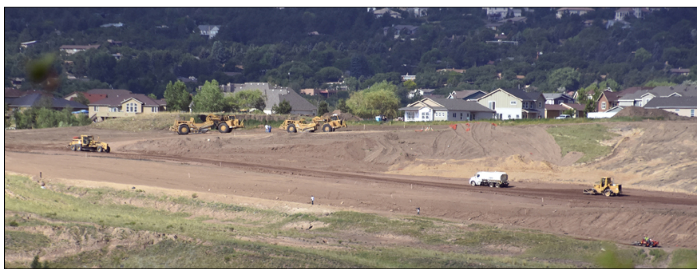
A fleet of heavy-equipment vehicles works on top of the former tailings dam earlier this year during preliminary grading for Gold Hill Mesa's Filings 9 and 10. The photo was taken from Promontory Point Open Space, about a half-mile north of Gold Hill Mesa.