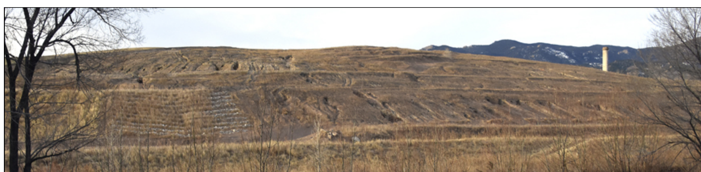
A view from Highway 24 in December shows the face of Gold Hill Mesa's tailings dam - including the development's contour grading and plantings to control runoff and the erosion rills that keep coming back when it rains. The dam face is to become open space. The photo below, taken from a higher vantage point, shows the top of the dam, where houses will be built.