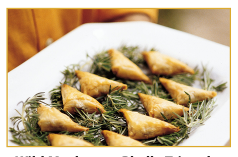
Wild Mushroom Phyllo Triangle: A blend of wild mushrooms and artisan cheese in a phyllo triangle.