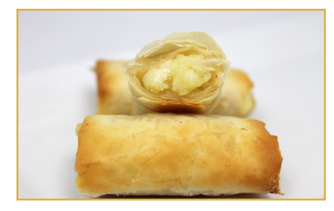
Pear and Brie Phyllo Roll: Creamy brie cheese, pear puree, and toasted almonds.