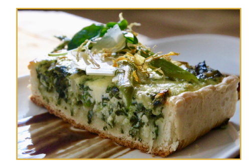
Gruyere and Leek Savory Tart:

Aged Gruyere, summer leeks, spinach, & a blend of cheeses loaded into our 14" large savory breakfast tart shell.