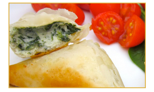
Spanakopita: Baby spinach mixed with Grecian feta cheese in a phyllo triangle.