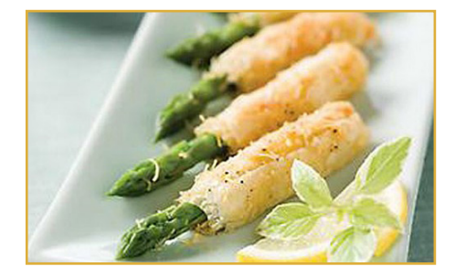
Asparagus Roll Up: Asparagus tips combined with a blend of asiago and bleu cheeses.