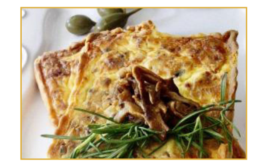
Bacon and Swiss Savory Tart:

Our 14" large savory breakfast tart loaded with Applewood smoked bacon & Swiss cheese.