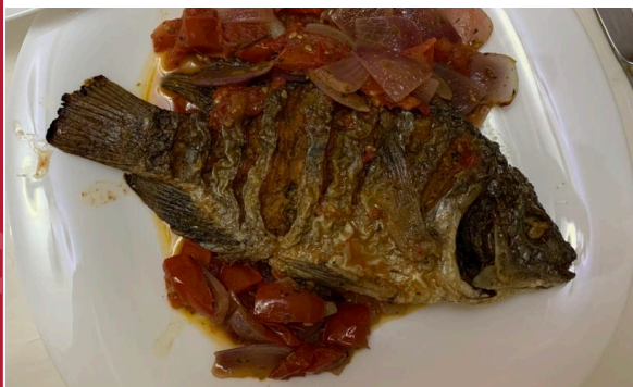
Grilled, Smoked Tilapia: A Local Specialty of the Luo People!