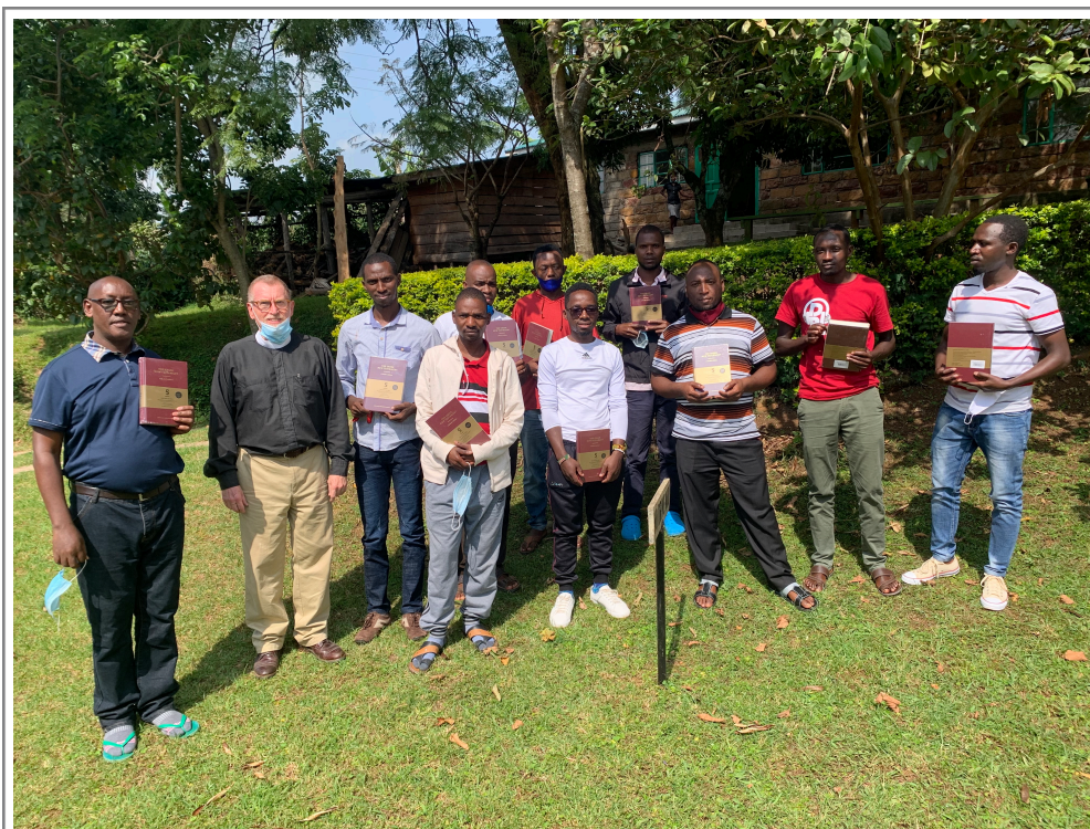
Matongo Students Receive Greek New Testaments

Yes! Classes have been ongoing. In our last newsletter, we told you that the government had closed the schools because of an increase in infections. Well... School has been open for some time, which is why you haven't heard from us. We've been busy! And busy is good!