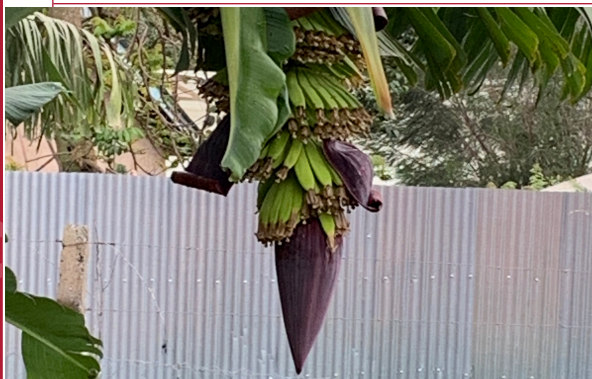
This is how bananas grow — right outside our home!