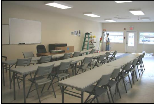
412 Roosevelt Drive - Upper Left – Retail or Office Unit