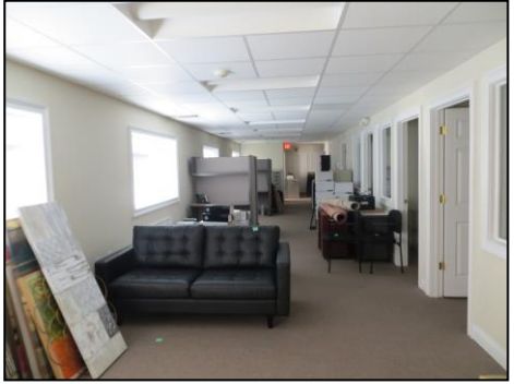
418 Roosevelt Drive – 2 nd Floor Office Unit