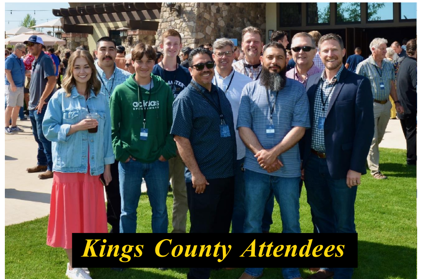
Kings County Attendees