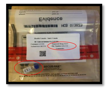
Photo of exhibit bag with sample vial. Note that the IDs on the vial and the label match and are clearly visible.

4.1. Place vials individually into tamper-proof exhibit bags (if not already). Label each sealed bag with the associated unique label. Crosscheck the sample number on the vial against the printed label before moving onto packaging the next sample.