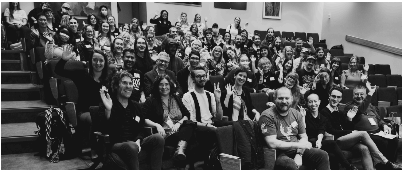
2023 Symposium Participants

-BC Centre on Substance Use and Fraser Health Authority