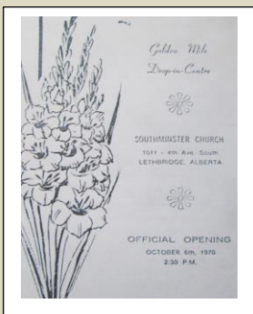
The Drop In Centre: 1970s the opening program cover for the Golden Mile Drop In Centre which was housed in the basement of Southminster United Church in the early 1970s.