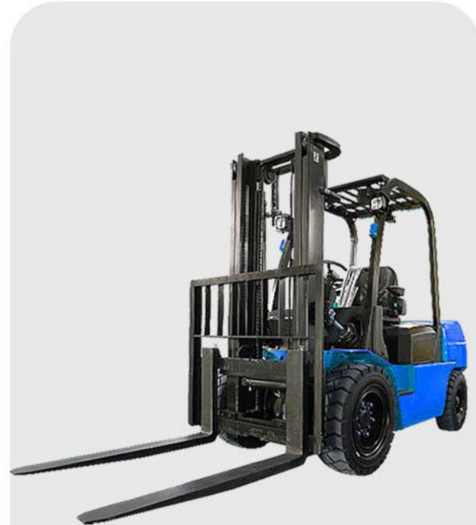
CPD-20 ELECTRIC FORKLIFT