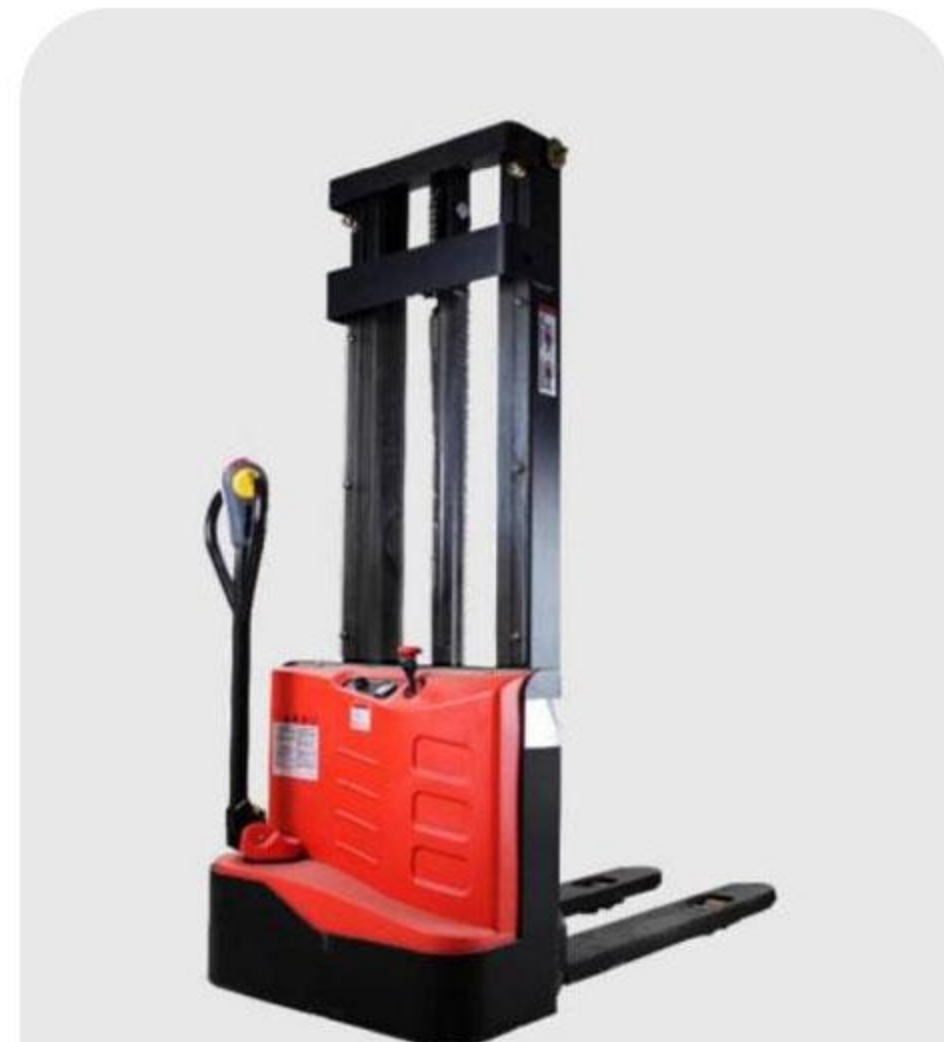
CDD-15 WALKING STACKER