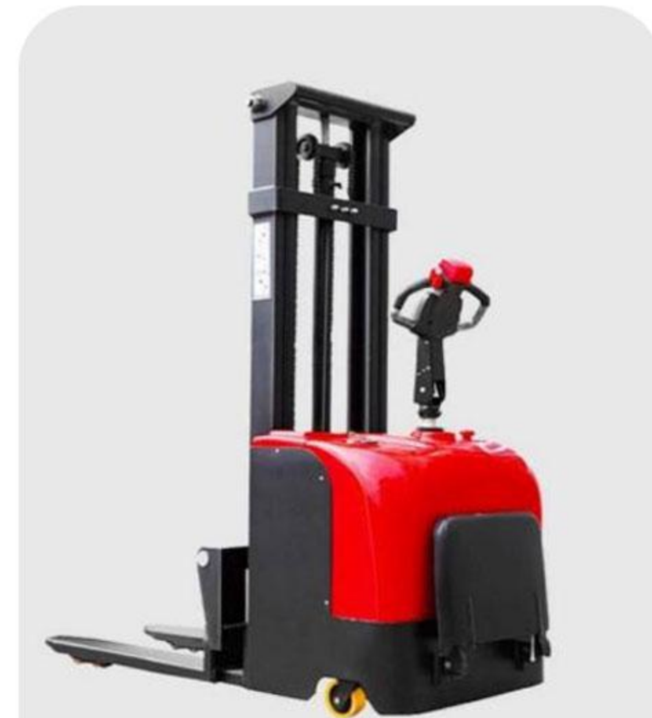
CDD-25 STANDING STACKER