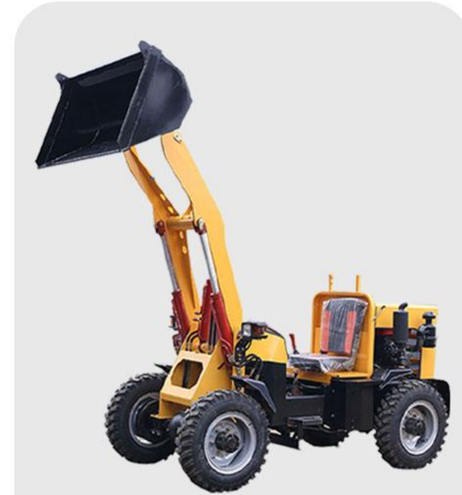
CPB-30 ELECTRIC FORKLIFT