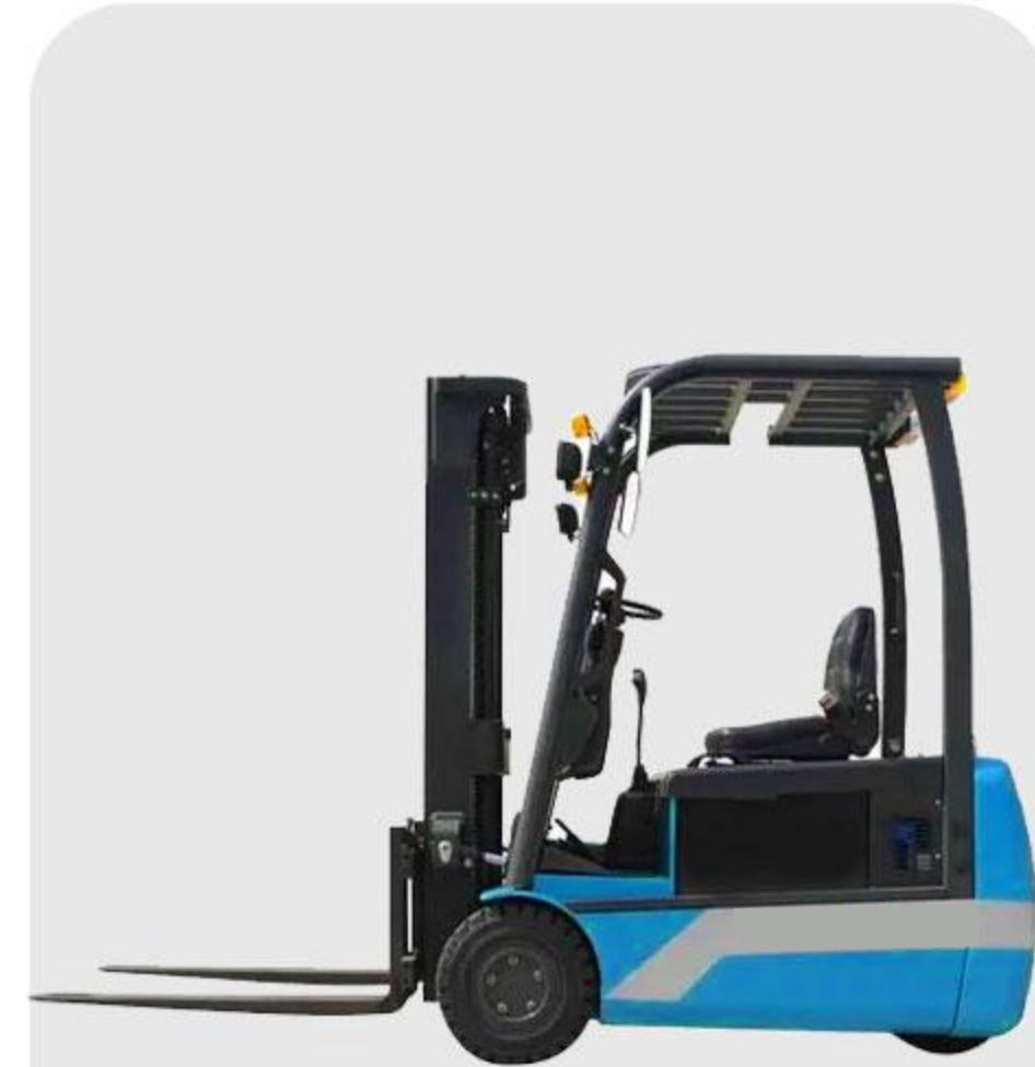
CPD-10 THREE POINT FORKLIFT