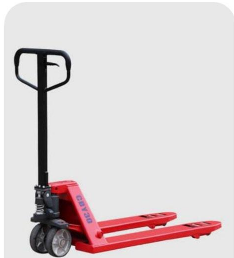
CBY-30 MANUAL PALLET TRUCK