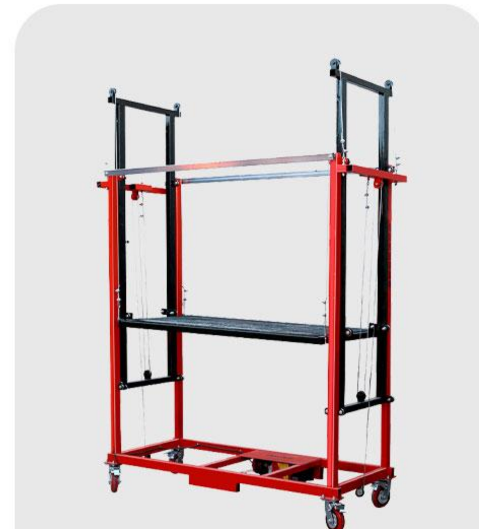
CPY-15 ELECTRIC SCAFFOLDING