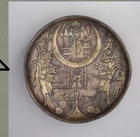
Moon god Nanna