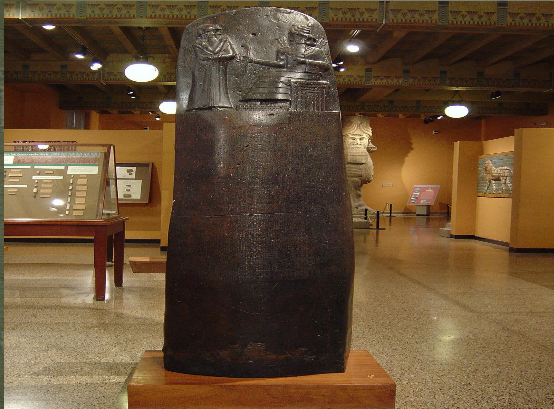
left - “Code of Hammurabi”