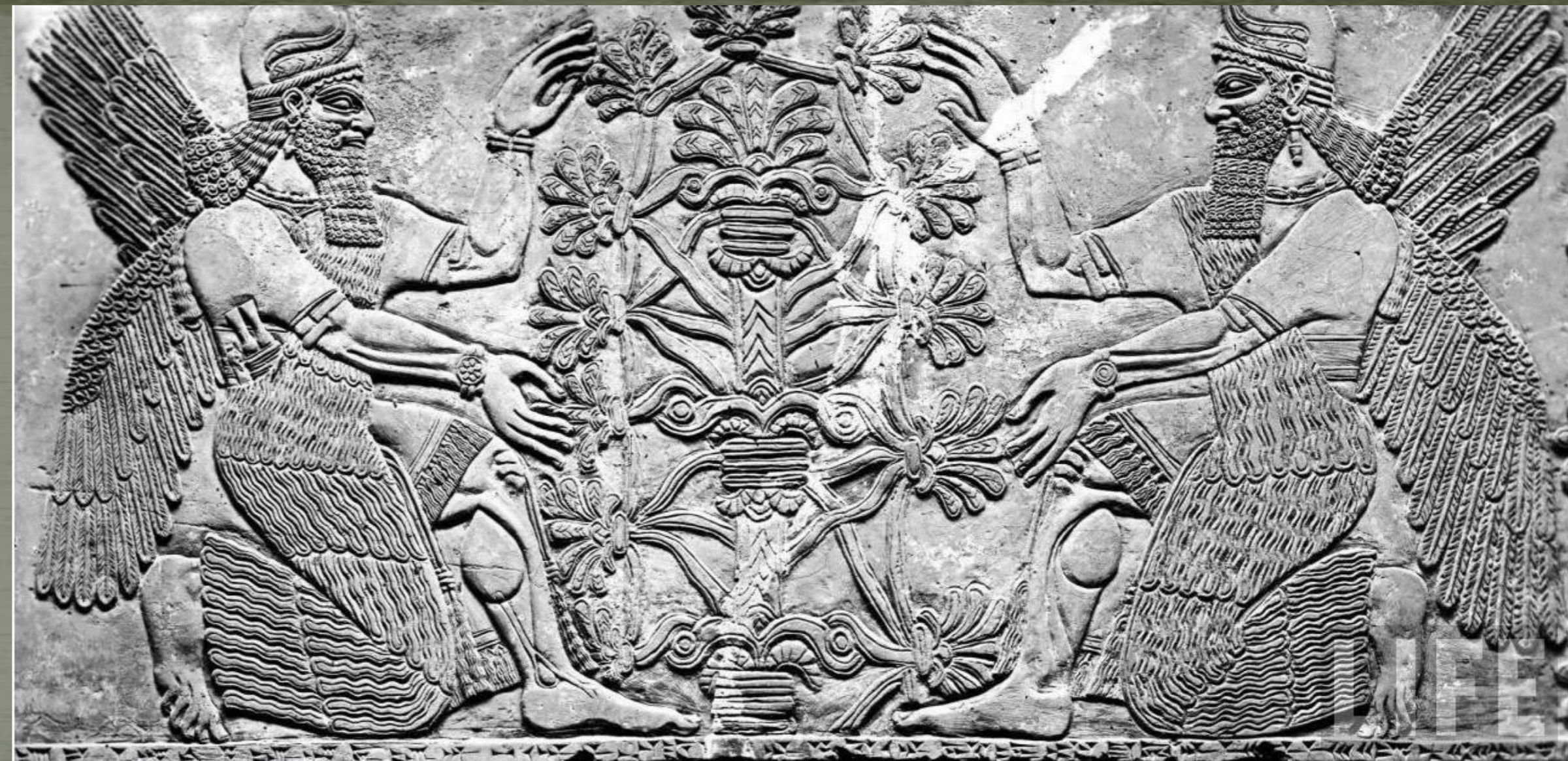
WINGED DEITIES KNEELING BESIDE A SACRED TREE

Marble Slab from N.W. Palace of Nimroud ; now in British Museum