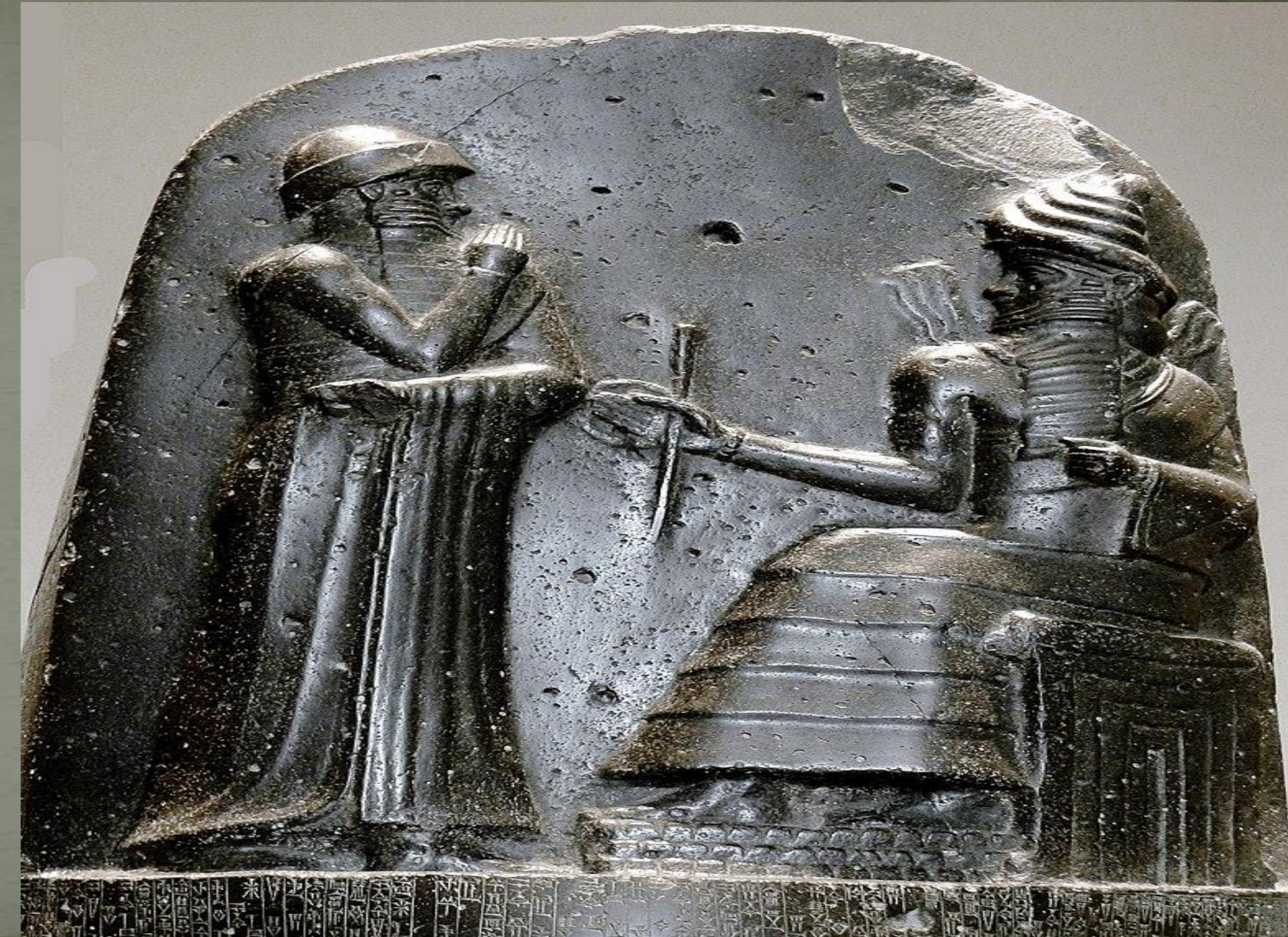
right - Hammurabi standing before the sun god Shamash ( Utu )