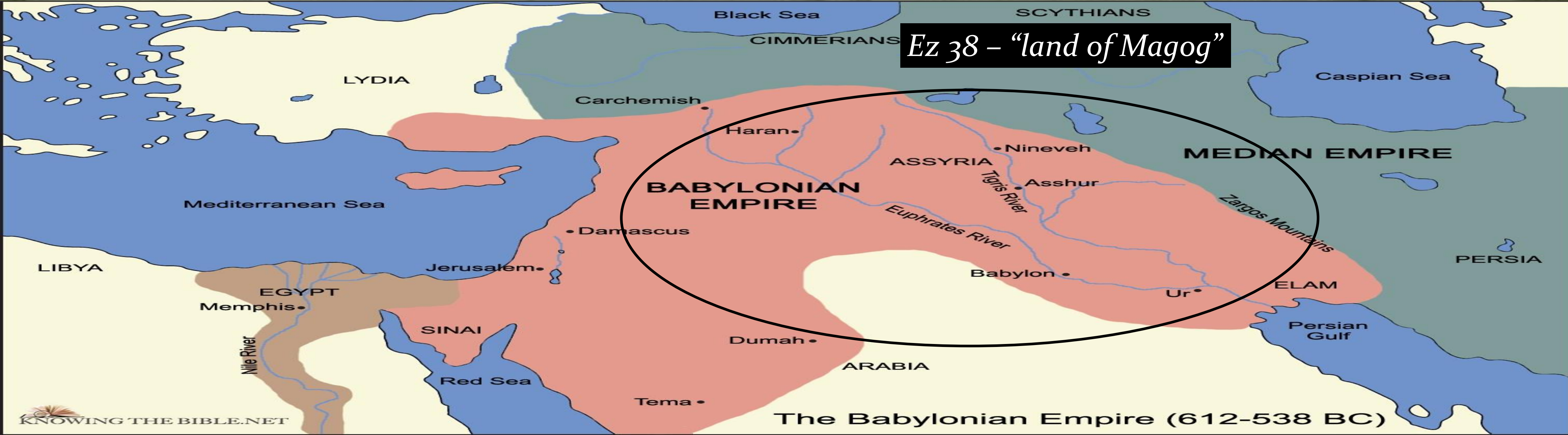
The Babylonian Empire (612-538 BC)